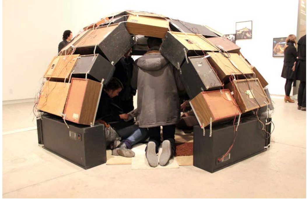
Alexis O'Hara SQUEEEQUE! The Improbable Igloo 2009 Installation view (Image 1/5)