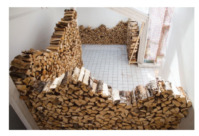
Carola Grahn, Horizon of Me(aning), 2015. Firewood installation. Variable dimensions.