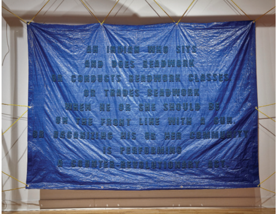
Native Art Department International, Untitled , 2017. Neon and Carl Beam artwork. Courtesy of the artist.

Amy Malbeuf, Jimmie Durham 1974, 2014. Tarp, beading. Courtesy of the Artist. Photo: M N Hutchinson