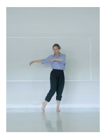
Tanya Lukin Linklater, you are judged to be going against the flow because you are insistent, 2017. Video.

embraces the wildly individualistic tumble of connections and contradictions that constitute contemporary Indigenous identities, opening a dialogue between artists, audiences, and the interconnected mesh-works woven between all our relations.