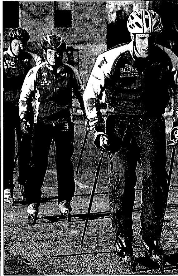
Members of the Varsity Blues ski team train on the road around King's College Circle to get in shape for the season.