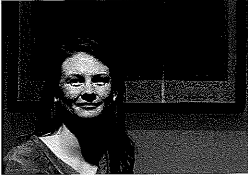
EXHIBIT SHOWCASES U OF T'S RARELY SEEN CHINESE PROPAGANDA COLLECTION