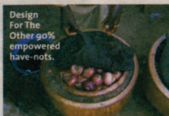
Design For The Other 90% empowered have-nots.

The BC sculptor's unsettling Storage Facilities installation combined cigarette