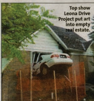
Top show Leona Drive Project put art into empty real estate.