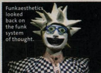
Funkaesthetics looked back on the funk system of thought.

butts, candy wrappers and other evidence of human weakness with dead animals, all cast from polymerized gypsum, into a dreamlike display that stuck in the mind, raising questions about escape and desire.