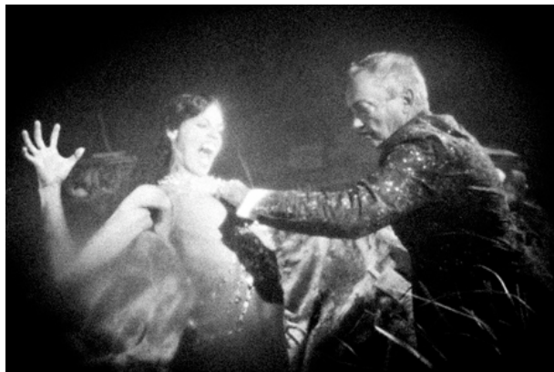
Guy Maddin Hauntings / 2010 Film still