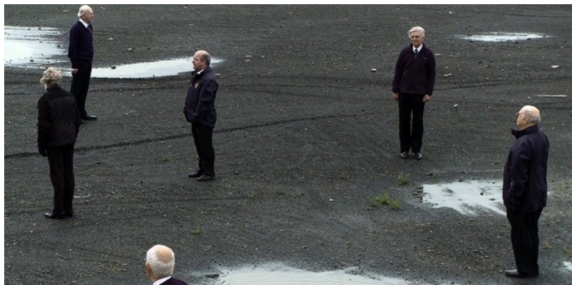
All Together Now

Presented by the Justina M. Barnicke Gallery