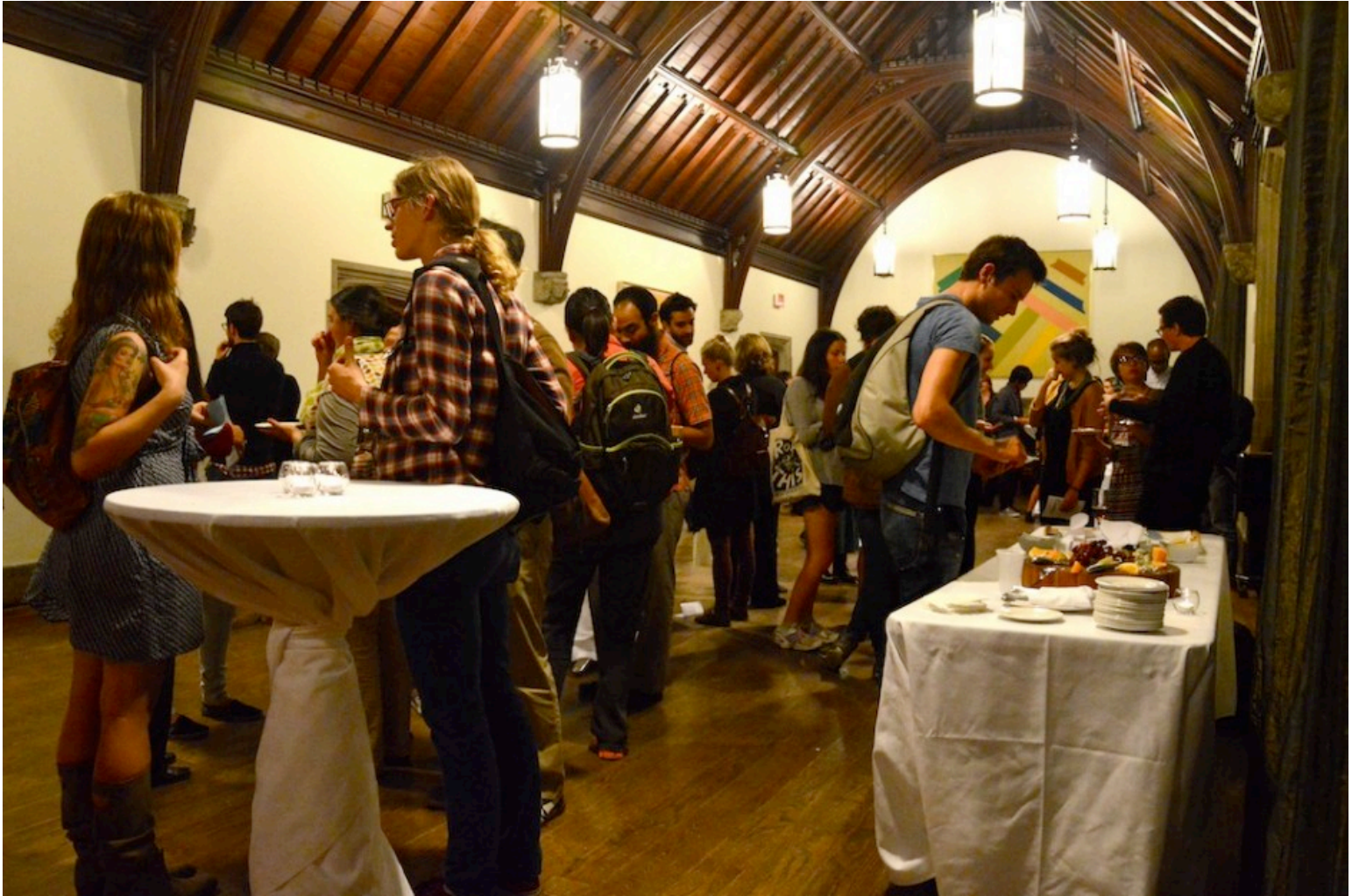
Attendees at the event celebrating the latest additions to the Hart House Art Collection.