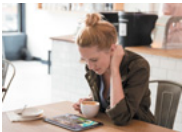
Look Forward The news is new again with Star Touch