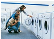
Appliance Deals Toronto Arrow Road Clearance Outlet