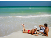
Vacation in Cuba Holiday Fun in the Cuban Sun