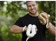
A service animal? Snakes, monkeys, pigs, oh my is that...