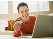
Online Deals Order appliances online now!