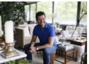
Defines his abode PHOTOS: Marketing manager transforms...