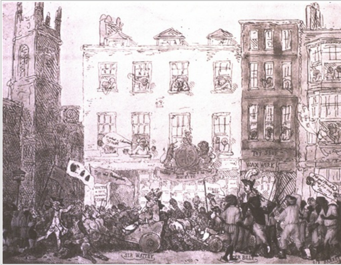
Godfried Donkor, London Mob, 2001, Inkjet print.

Opening Reception: Saturday 21 January 2:00 – 4:00 pm Curators' Tour with Pamela Edmonds and Sally Frater: Saturday 21 January 1:00 – 2:00 pm