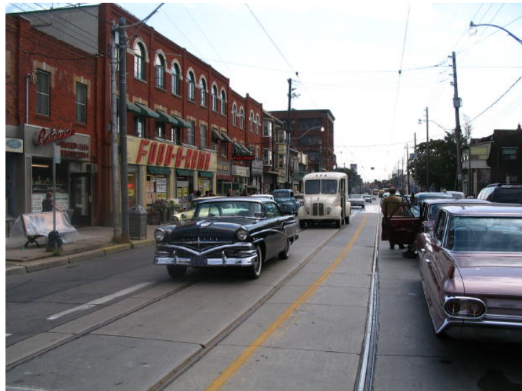
The Hairspray set, Dundas Street West just east of Roncesvalles Avenue.

My neighbourhood has been overtaken by Studebakers and bobby soxers. Abandoned buildings have turned into unfamiliar shops and storefront chapels overnight. Ads for “wiglets,” hefty fashions and rock’n’roll 45s abound. Soon, I hear, John Travolta will land. It’s all very disconcerting – not the least because this is a movie version of the musical version of the movie Hairspray by John Waters, a man I grew up associating with dog shit and Divine. I begin to question my hold on reality when I can’t tell which stores are fake and which have always been there. That tells you as much about my neighbourhood as it does my powers of observation.