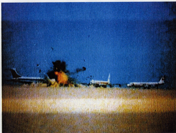
Johan Grimonprez DIAL H-I-S-T-O-R-Y 1997