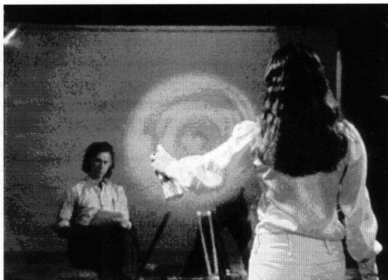
Photo caption: Michael Snow, Two Sides to Every Story , 1974, collection of the National Gallery of Canada

www.galeriereneblouin.com/History/Shows/2007/3_kline-07/GRB_kline07_1.html