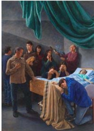
Kent Monkman, Death of The Virgin (After Caravaggio) , 2016.