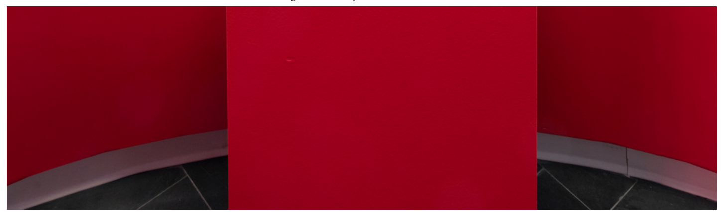
Adrian Stimson, Calling My Spirit Back , 2017. Nine black and white digital prints, inkjet text on paper, dimensions variable.

Adrian Stimson's work Calling My Spirit Back , a new work created specifically for "Morning Star," was born out of conversations between Stimson and Doull. A two-part work consisting of photographs taken by Stimson during a residency in Australia and two journals which detail his dreams, Calling My Spirit Back collapses past, present and future within the dreamscape.