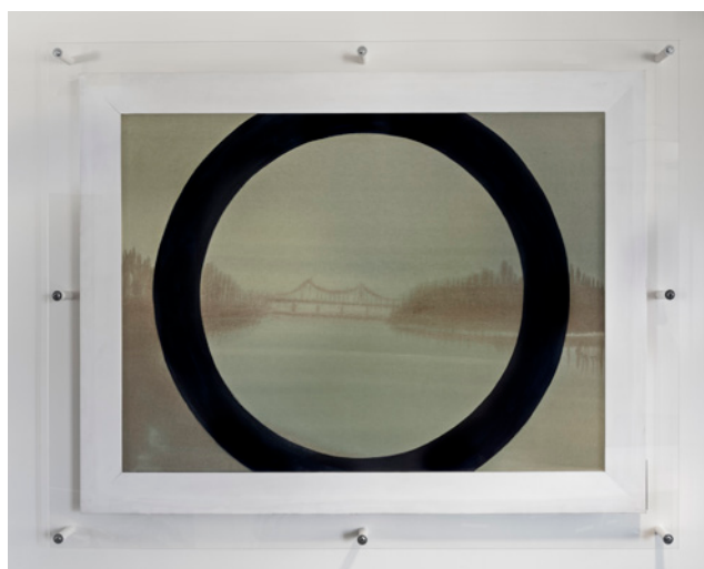
Wanda Koop (Black Line) Sightlines , 2000 Acrylic, 90 x 123 cm