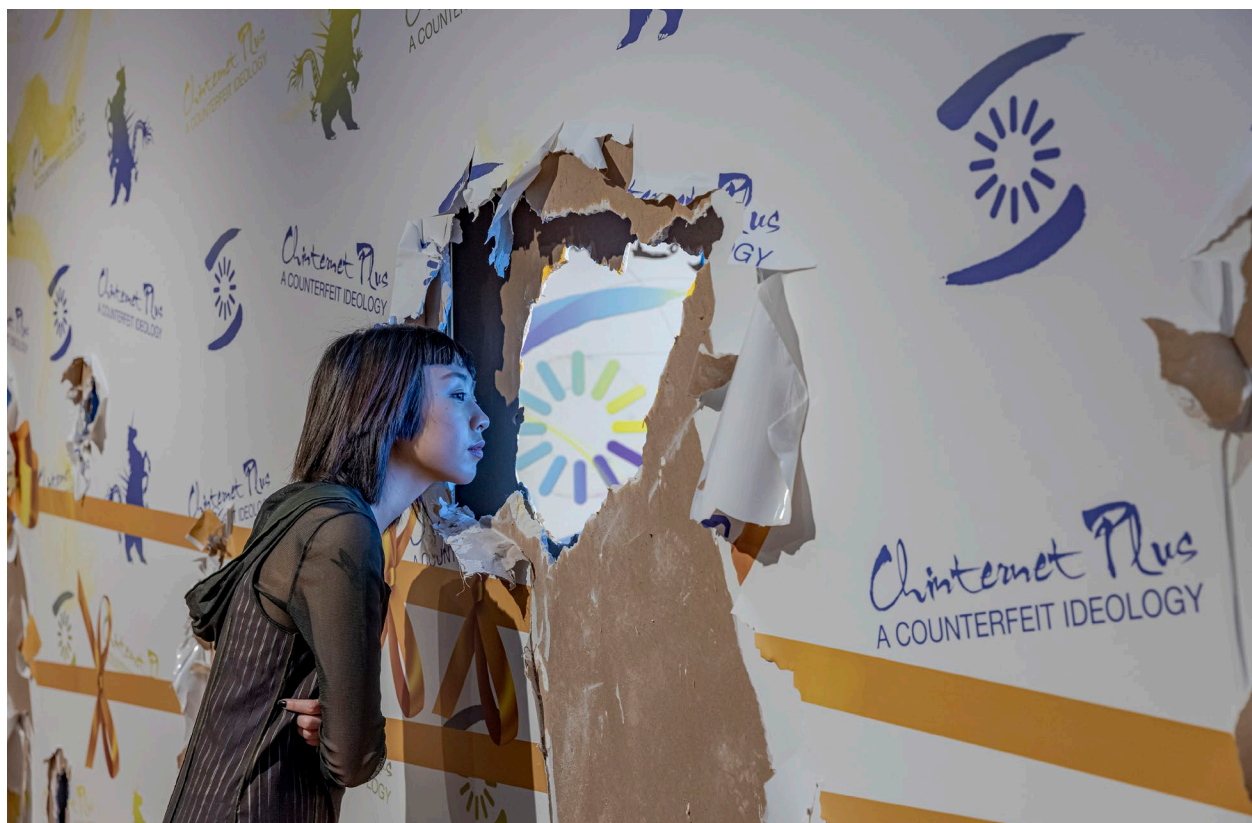
Installation view. Chinternet Plus (亲特网+, 2016). Multimedia installation.