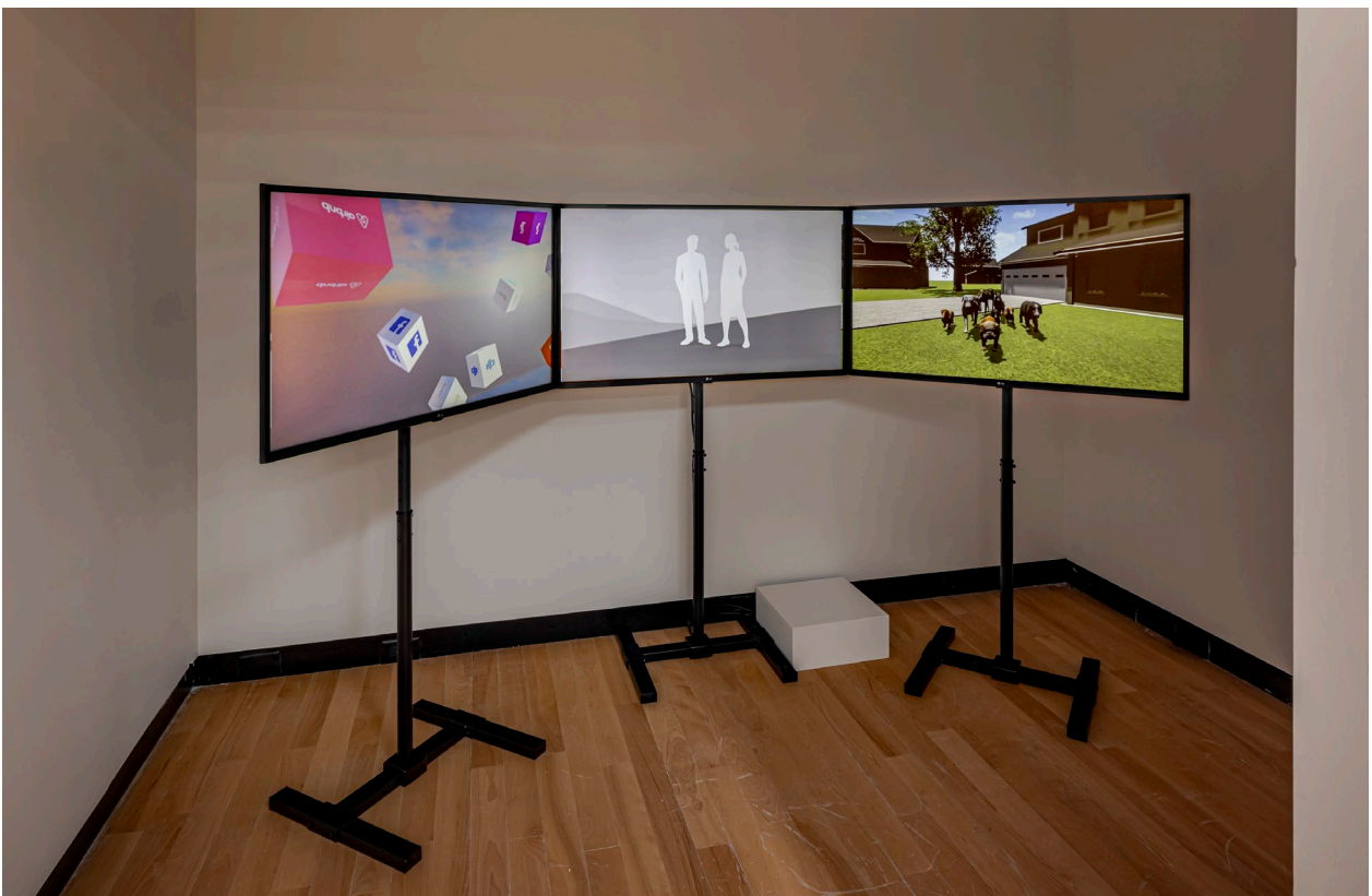
Installation view. Hardcore Digital Detox (硬核数据排毒, 2018). Multimedia installation.