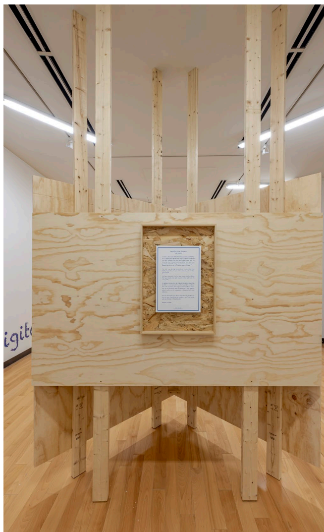
Installation view. Hardcore Digital Detox (硬核数据排毒, 2018). Multimedia installation.