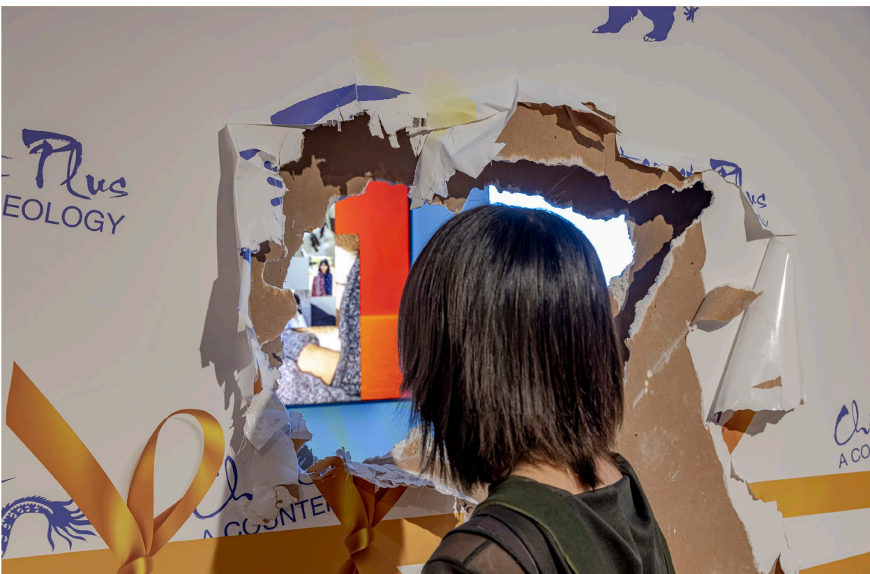
Installation view. Chinternet Plus (亲特网+, 2016). Multimedia installation.