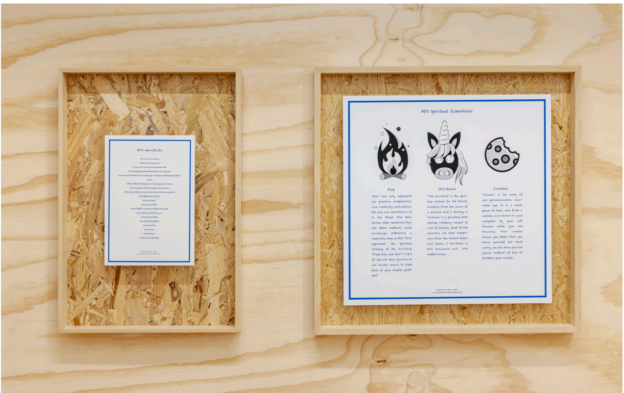
Installation view. Hardcore Digital Detox (硬核数据排毒, 2018). Multimedia installation.