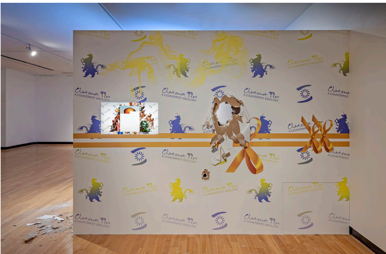
Installation view. Chinternet Plus (亲特网+, 2016). Multimedia installation.