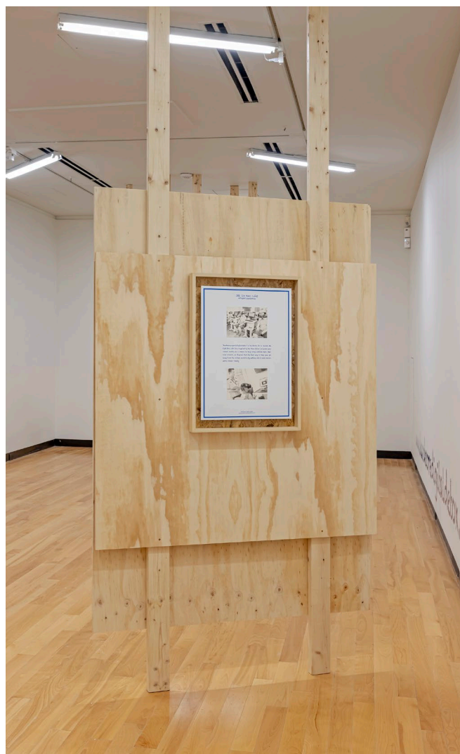
Installation view. Hardcore Digital Detox (硬核数据排毒, 2018). Multimedia installation.