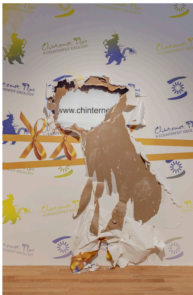
Installation view. Chinternet Plus (亲特网+, 2016). Multimedia installation.