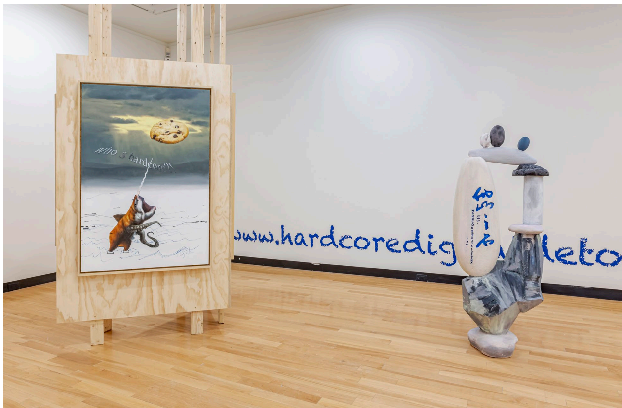
Installation view. Hardcore Digital Detox (硬核数据排毒, 2018). Multimedia installation.