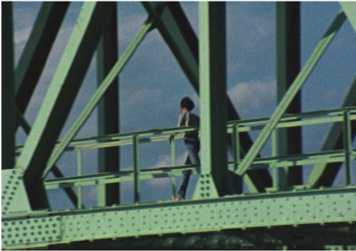
Alanis Obomsawin, Incident at Restigouche , 1984 (still). Courtesy of the National Film Board of Canada.