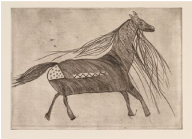
Alanis Obomsawin, Untitled , n.d., drypoint. Courtesy of the artist. Photo: Emily Gan.