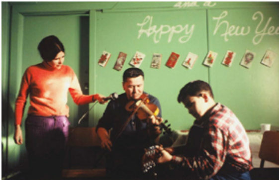
Christmas at Moose Factory , c. 1971 (production photograph). Courtesy of the National Film Board of Canada and the artist.