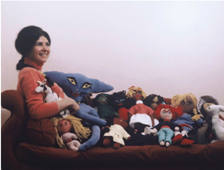
Alanis Obomsawin with her handmade toys, n.d.

media coverage of her in this period, the tone is sympathetic and somewhat patronizing at the same time, but her own agenda nevertheless comes through.