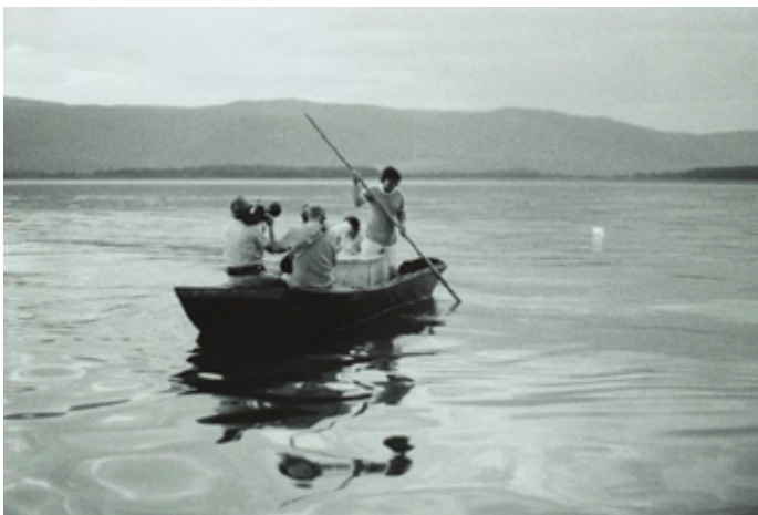
Incident at Restigouche, 1984 (production photograph). Courtesy of the National Film Board of Canada and the artist.