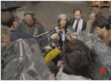
Alanis Obomsawin pictured in Le Téléjournal (CBC/ Radio-Canada) newscast, 1990.