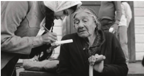
Alanis Obomsawin conducts an interview for Mother of Many Children , 1977.