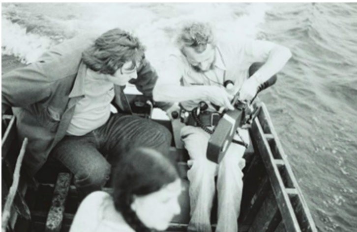
Incident at Restigouche , 1984 (production photograph).