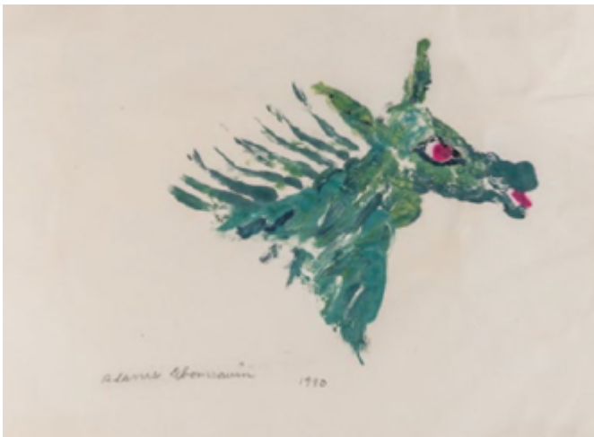
Alanis Obomsawin, Untitled , 1990, monotype. Courtesy of the artist. Photo: Emily Gan.