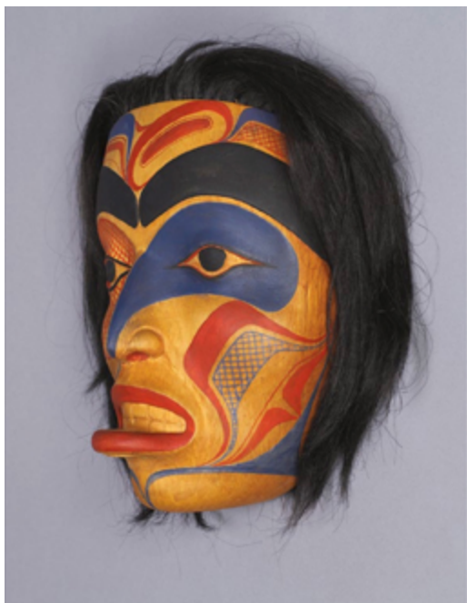
Bill Reid, nijjaang.uu ( Portrait Mask ), 1970, wood, paint, human hair. Courtesy of the Museum of Anthropology, The University of British Columbia, Vancouver, Canada, Walter C. Koerner Collection, A2617, Photo: Kyla Bailey. Courtesy of the Bill Reid Estate.