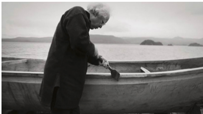
Alanis Obomsawin, Bill Reid Remembers , 2021 (still). Courtesy of the National Film Board of Canada.

Obomsawin builds a compelling and detailed picture of long-standing inequity through the accounts of those fighting the issue and the drama of courtroom testimony.