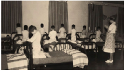
Alanis Obomsawin, We Can't Make the Same Mistake Twice , 2016 (stills).