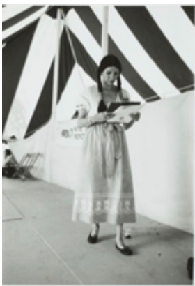
Alanis Obomsawin at Mariposa Folk Festival, Orillia, Ontario, n.d.