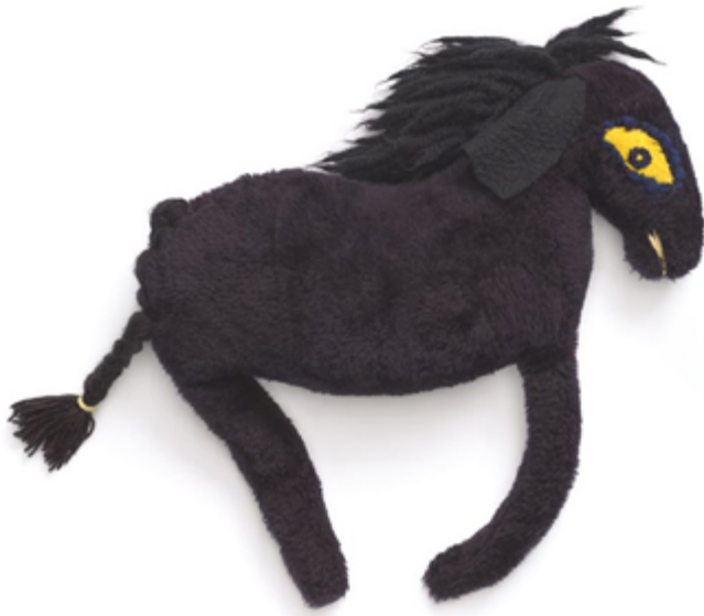
Handmade toy by Alanis Obomsawin, n.d.