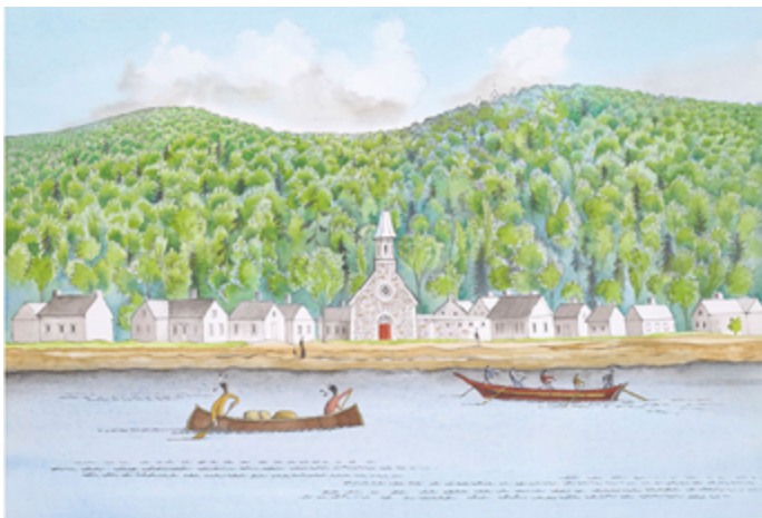
Robert Verrall, Kanehsatake: 270 Years of Resistance , c. 1993 (production drawing), watercolour on paper.