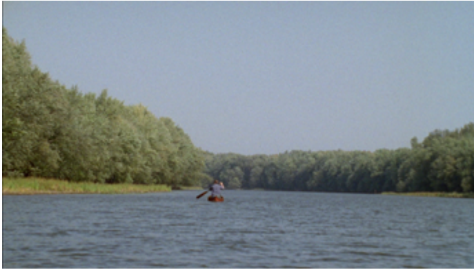
Alanis Obomsawin, Wabanki: People from Where the Sun Rises , 2006 (still).