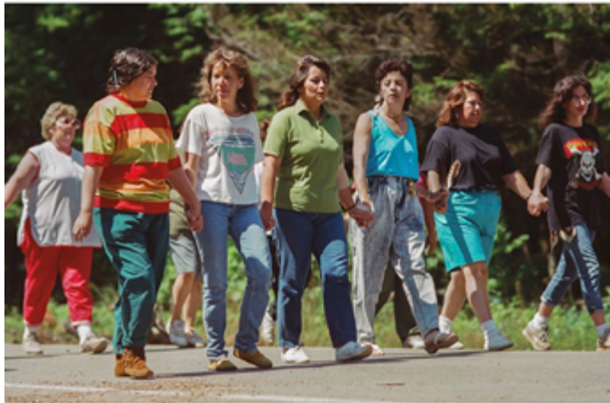
Mohawk women marching in solidarity during the Kanehsatà:ke Resistance near Oka, Québec, 1990.