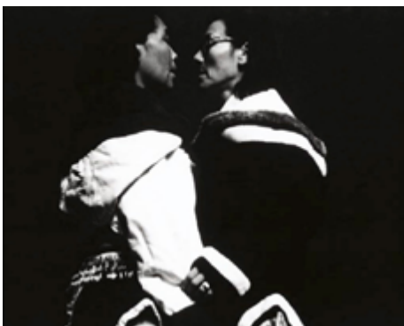
Amisk , 1977 (production photograph).