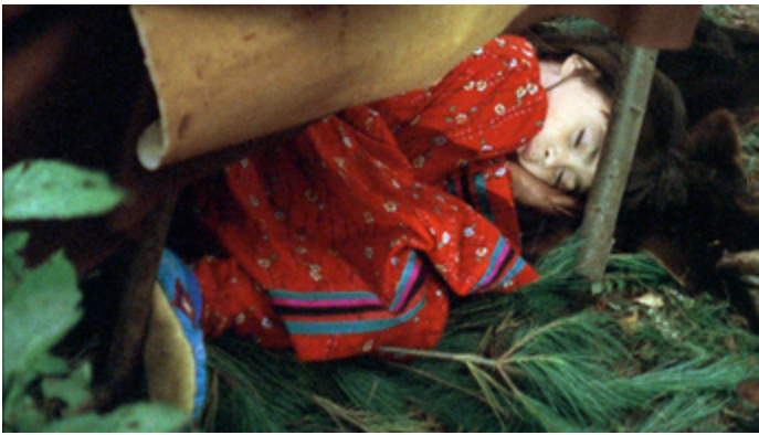
Alanis Obomsawin, Sigwan , 2005 (still).