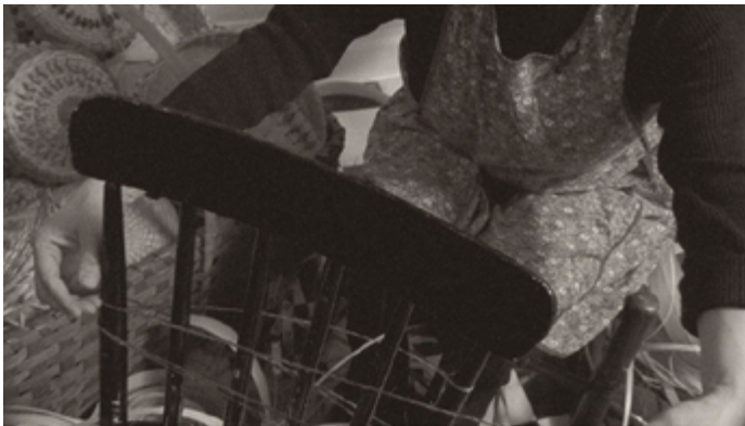
Alanis Obomsawin, Wabanki: People from Where the Sun Rises , 2006 (stills). Courtesy of the National Film Board of Canada.