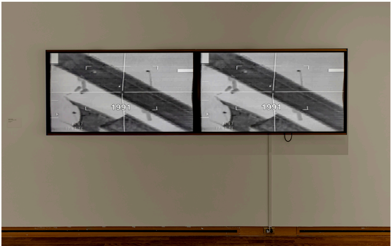
Harun Farocki War At A Distance , 2003 documentary film 58 minutes