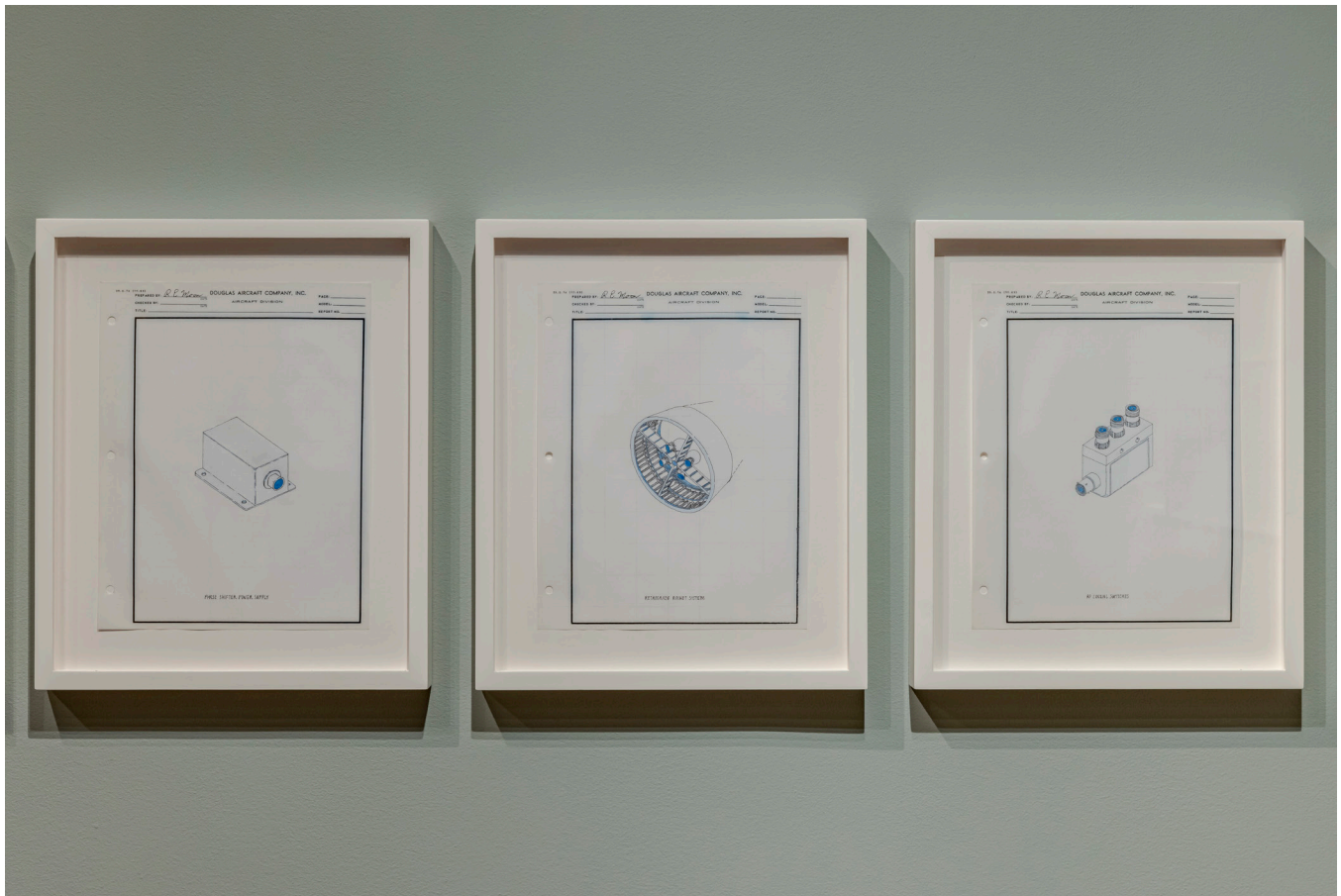
Hajra Waheed Signed R.E. Moon 1-24, 2015 ink and aquarelle pencil on paper