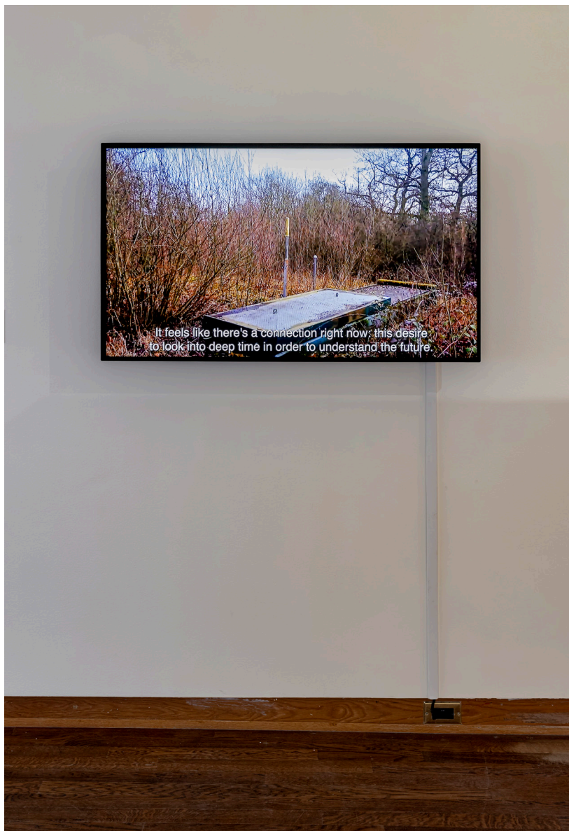
James Bridle Se ti sabir , 2019 single-channel video 18:48 minutes