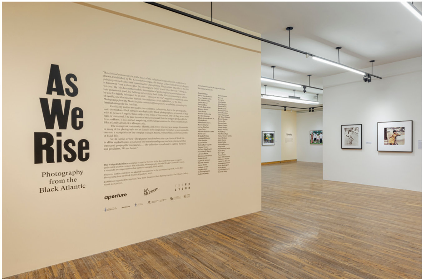
Title wall of As We Rise: Photography from the Black Atlantic .