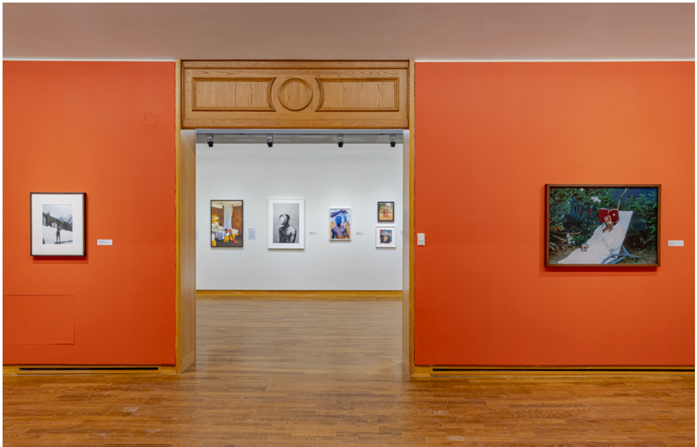
Left: Mohamed Camara, from the series Certains Matins , 2006. Archival pigment print.