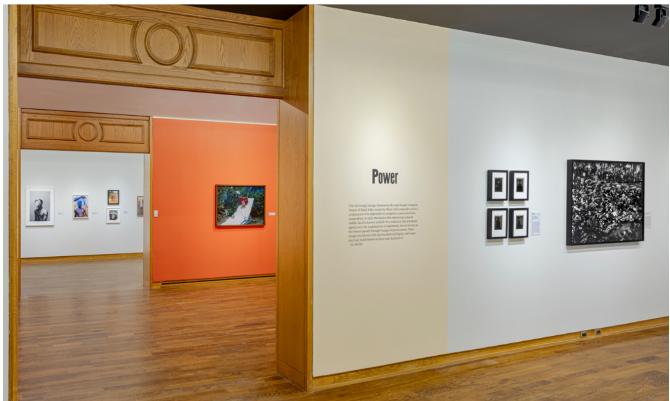
Installation view. As We Rise: Photography from the Black Atlantic.