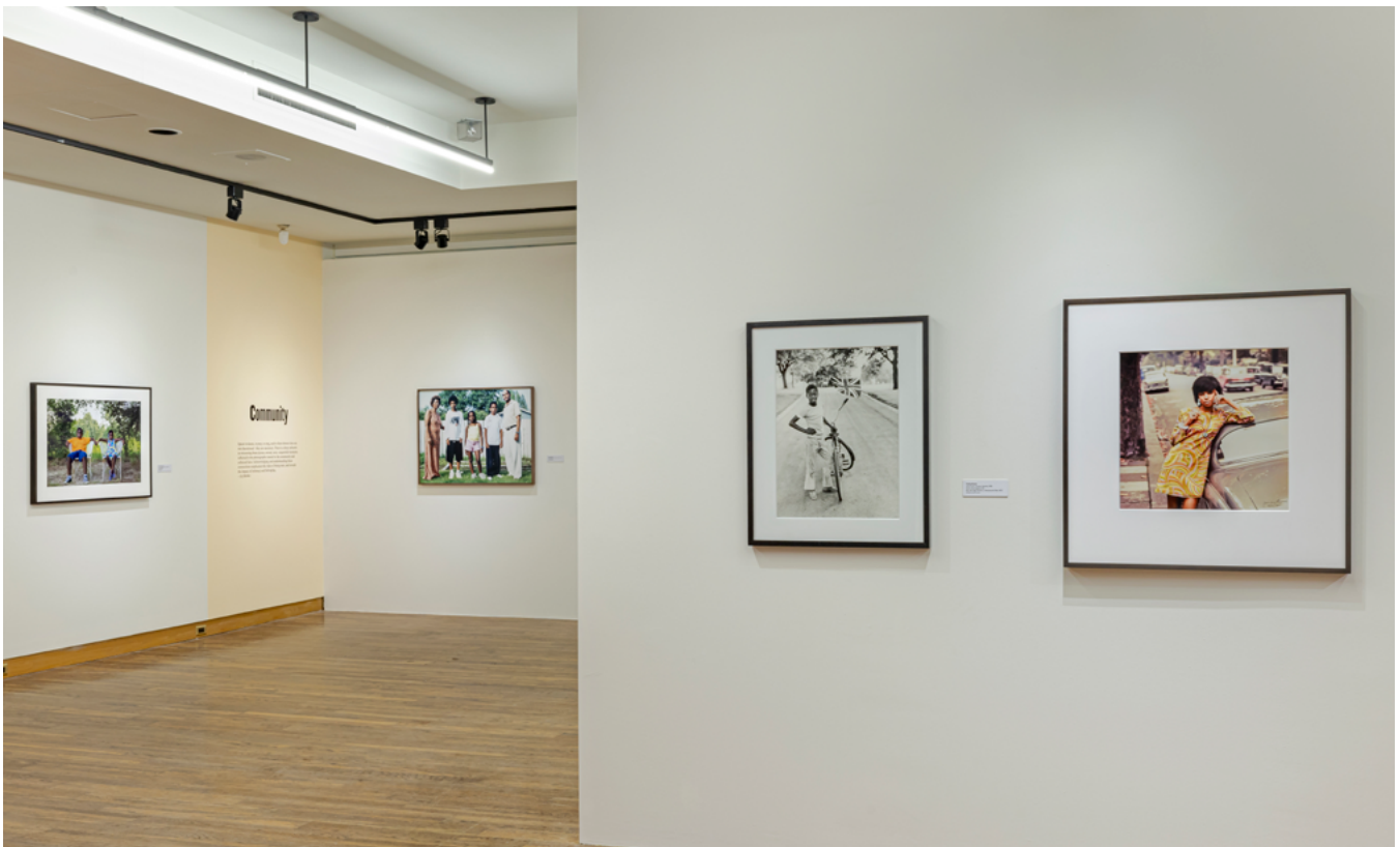
Installation view. As We Rise: Photography from the Black Atlantic.