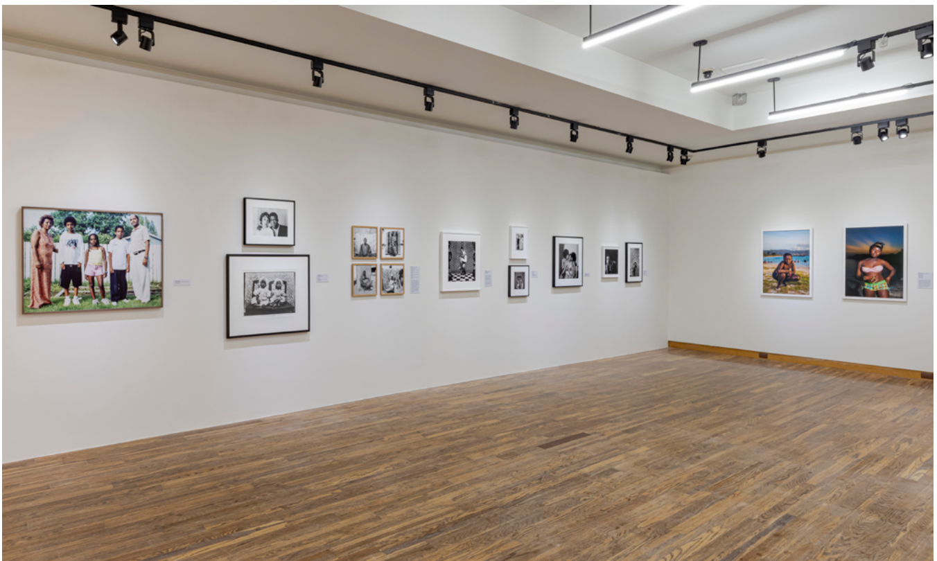
Installation view. As We Rise: Photography from the Black Atlantic.