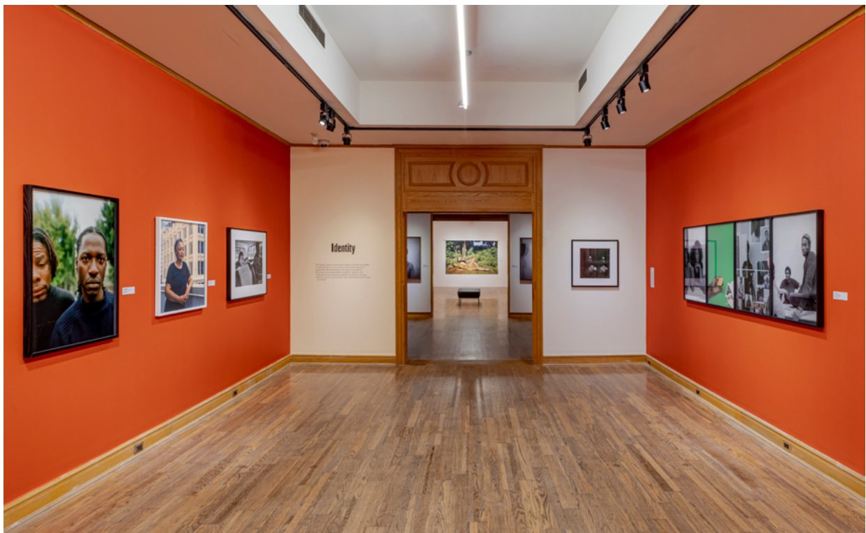
Installation view. As We Rise: Photography from the Black Atlantic.