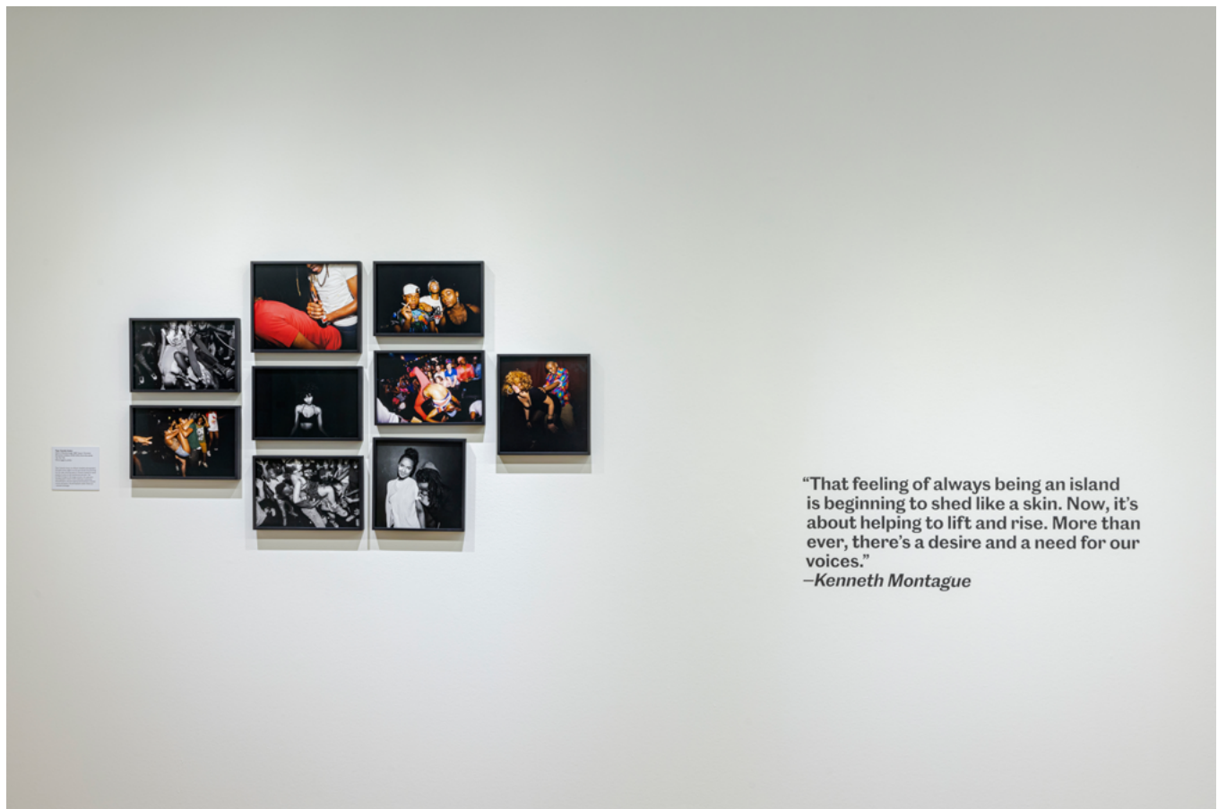
1-9. Tayo Yannick Anton, Untitled , 2009–2014; from the series Yes Yes Y'all . Chromogenic prints.