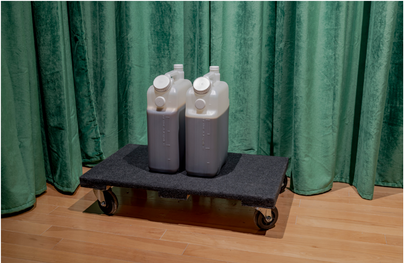
Common Accounts (Igor Bragado and Miles Gertler), You're Well Liked in Your Community , 2023, multimedia installation death-care industry slogans, mourners' comments, data measures, alkaline hydrolysis fluid remains, heavy duty polyethylene, curtains, single-colour LED sign.