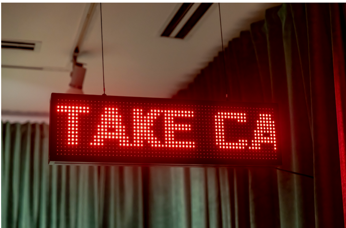
Common Accounts (Igor Bragado and Miles Gertler), You're Well Liked in Your Community , 2023, multimedia installation death-care industry slogans, mourners' comments, data measures, alkaline hydrolysis fluid remains, heavy duty polyethylene, curtains, single-colour LED sign.