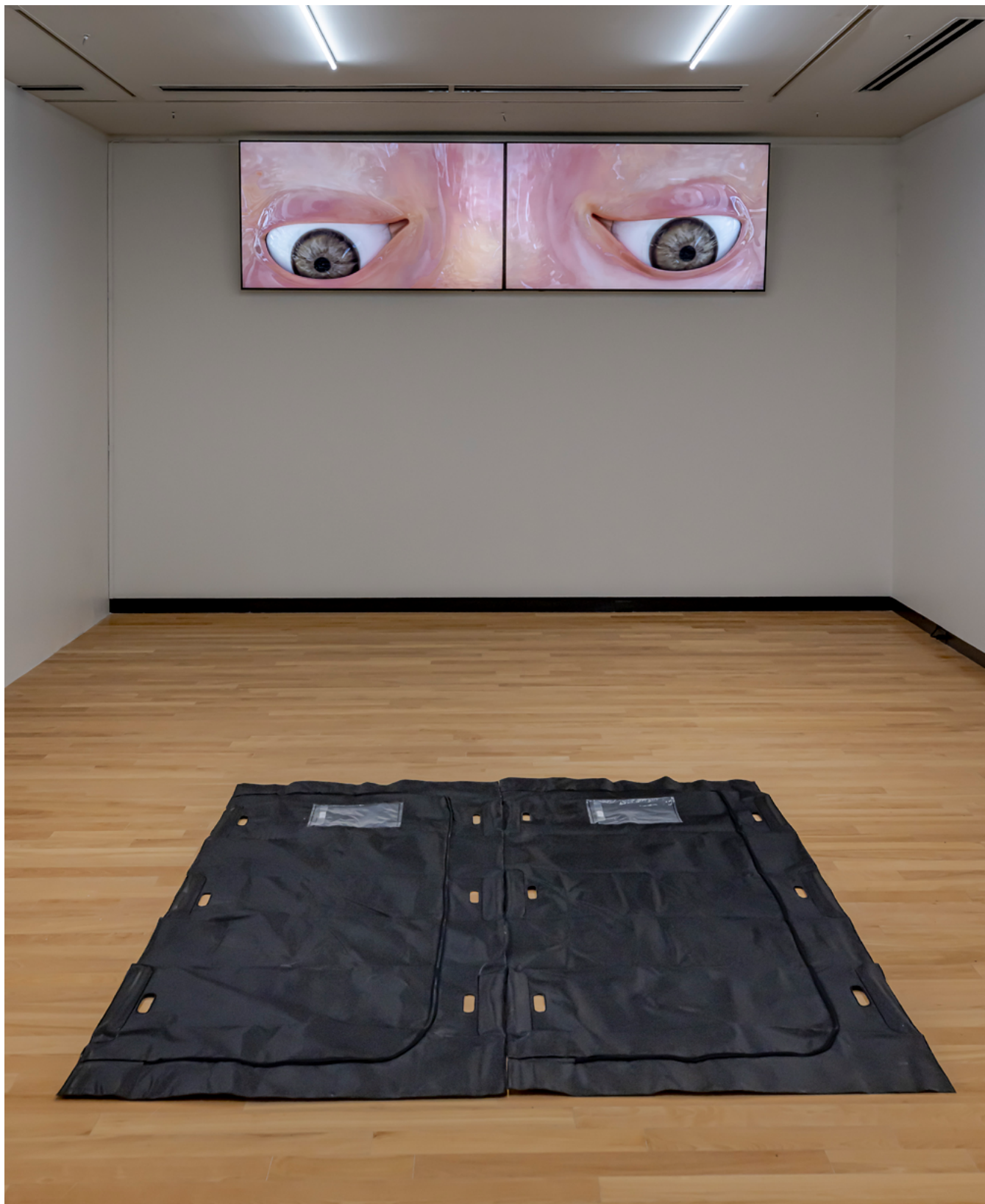
Up: Stine Deja, Suspended Vision , 2019, video, 04:19 minutes.