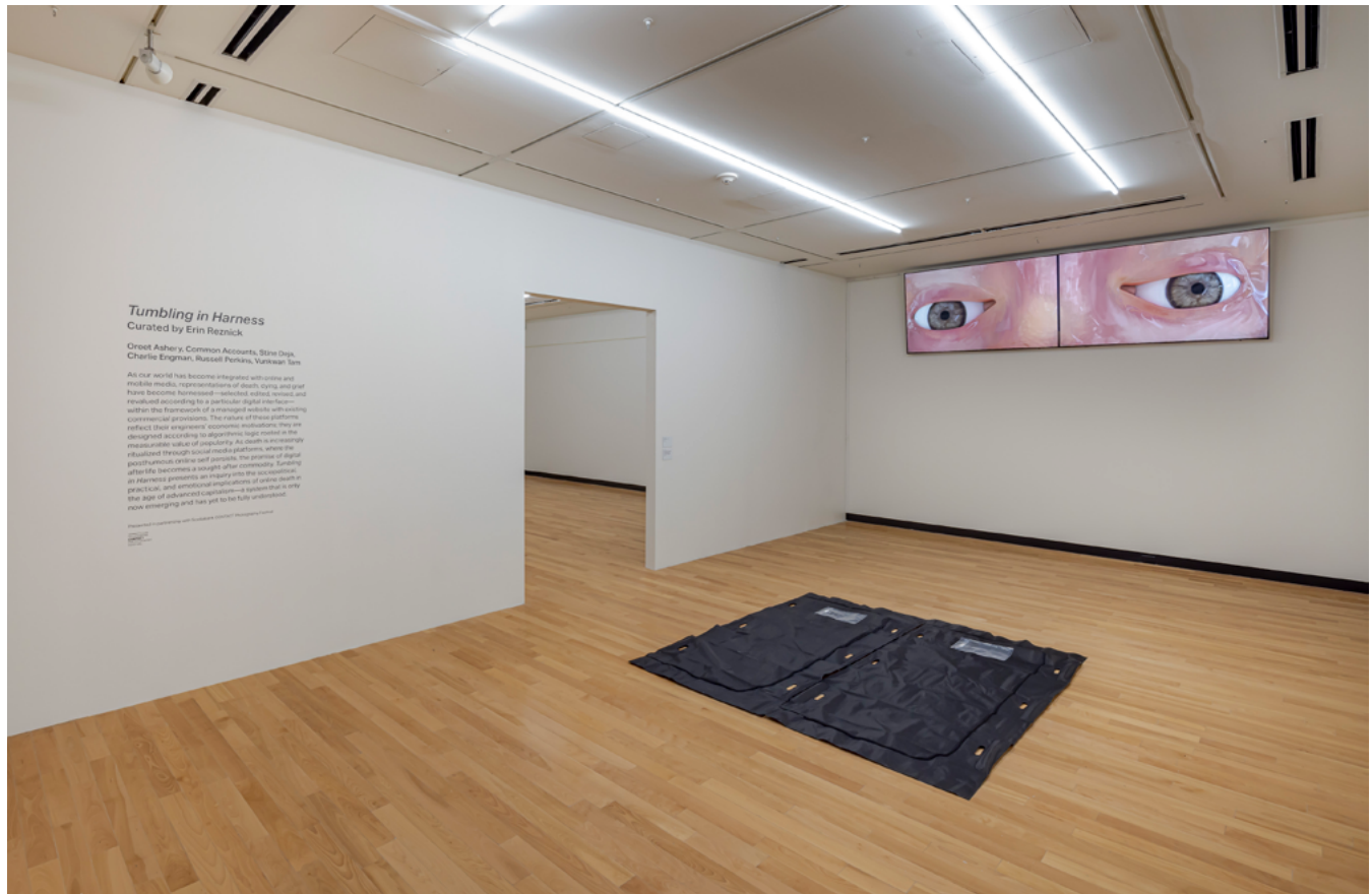
Installation view. Tumbling in Harness , 2023.