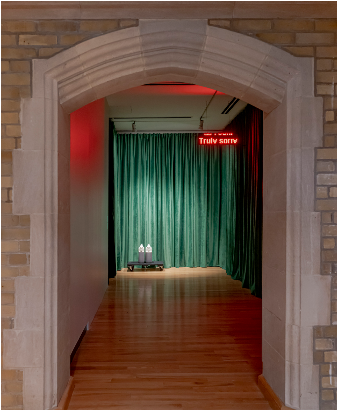
Common Accounts (Igor Bragado and Miles Gertler), You're Well Liked in Your Community , 2023, multimedia installation death-care industry slogans, mourners' comments, data measures, alkaline hydrolysis fluid remains, heavy duty polyethylene, curtains, single-colour LED sign.