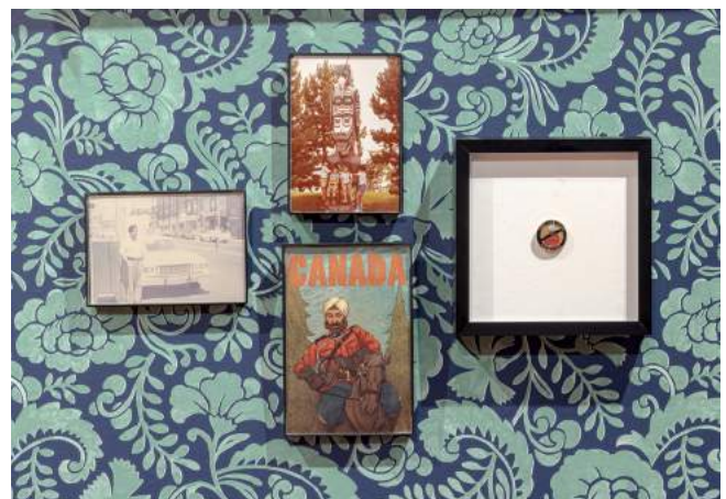
Pamila Matharu, INDEX (SOME OF ALL PARTS) , 2019—. Unique mixed-media installation.