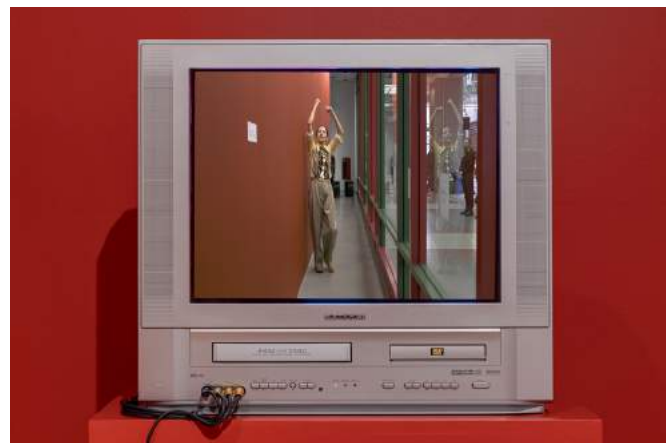
Justine A. Chambers, Heirloom , 2023—. Performance archive.