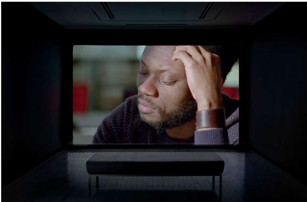
Louis Henderson, Bring Breath to the Death of Rocks , 2018. Super 16mm transferred to HD video, colour, sound, English subtitles, 28 min.