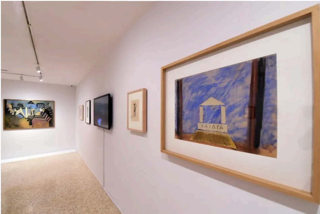
Jean Cocteau, "the Juggler's Revenge" at Peggy Guggenheim Collection in Venice, Italy.

The largest retrospective ever organized in Italy dedicated to Jean Cocteau (1889–1963), the enfant terrible of the French twentieth-century art scene highlights the artist's versatility and the multiple juggling acts that distinguished his production, which often drew criticism from his contemporaries. It's a chance to see works from private collections plus from the Centre Georges Pompidou in Paris, the Phoenix Art Museum, the Nouveau Musée National de Monaco, and the Musée Jean Cocteau, Collection Séverin Wunderman in Menton. Over 150 works on show include drawings, graphics, jewelry, tapestries, historical documents, books, magazines, photographs, documentaries, and films directed by Cocteau.