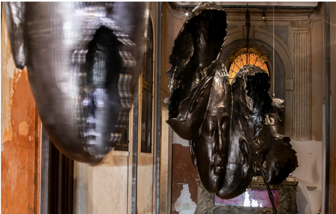
Wallace Chan, 'Transcendence' at the Venice Biennale 2024 FEDERICO SUTERA

Escape from the tourist crowds and immerse yourself in a soothing, spiritual exhibition of stunning titanium sculptures created by a former Buddhist monk.