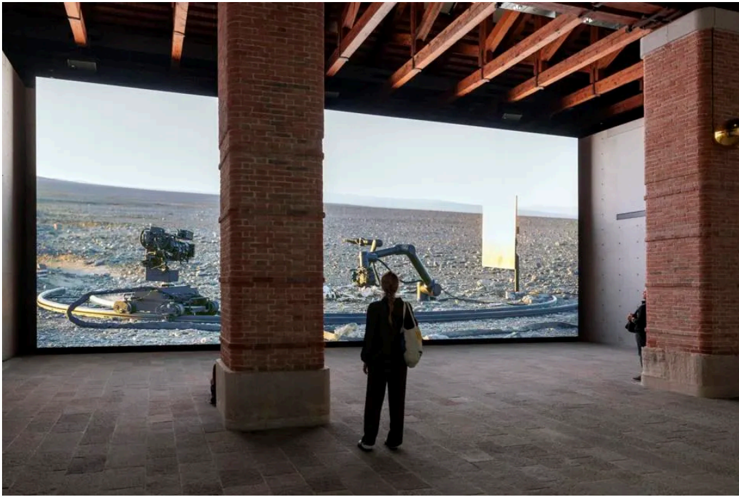
Liminal by Pierre Huyghe at Punta Della Dogana, Venice, Italy.

This deeply spooky show across the cavernous space of the Punta della Dogana extends the French artist's longtime exploration of otherness, conceived here as the experience of reality in biological, chemical, and technological entities that are not human. His work careens between cybernetics, neuroscience, sci-fi, philosophy, and fantasy, at its best making the complex issues involved in all of them engagingly intelligible.