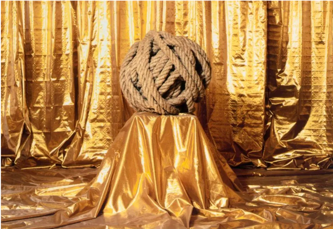
James Lee Byars, " Byars is Elephant " at Palazzo Loredan, Venice

A Korean artist who should be much better known to Westerners is Seung-taek Lee (b. 1932) who is shown alongside American artist James Lee Byars (1932-1997). Although the two artists didn't ever meet, this exhibition in a stunning library near the Accademia bridge illustrates fascinating parallels in their work and it's even sometimes difficult to determine who did what. Both artists share a deep curiosity for history and the arts of the past. It's a gorgeous show featuring gleaming sculptures of gold, wood and rope.