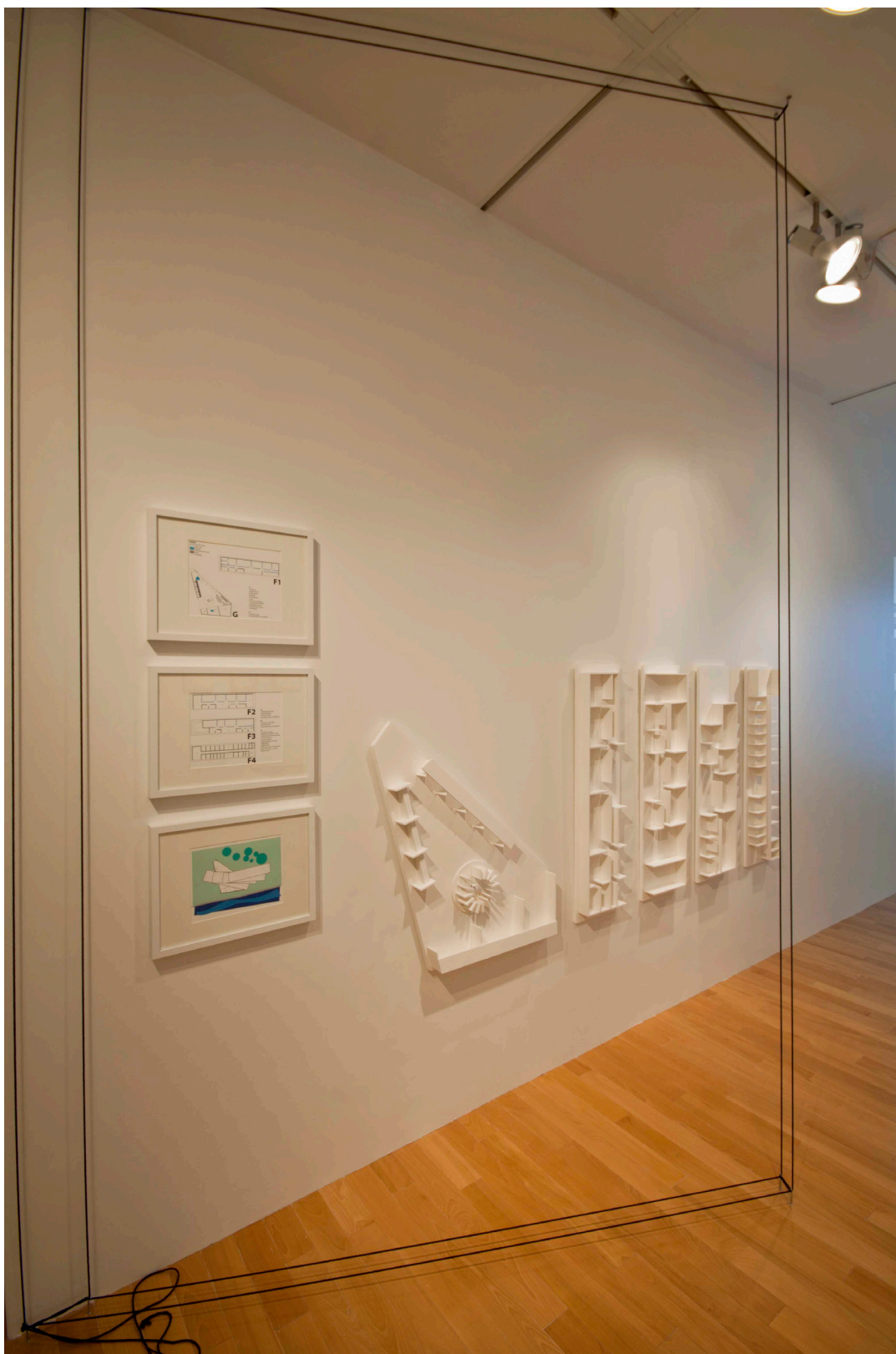
Yvonne Lammerich, The Virtual TMCA/ MACT Project: Overture , 2009. Mixed-media installation and video projection.