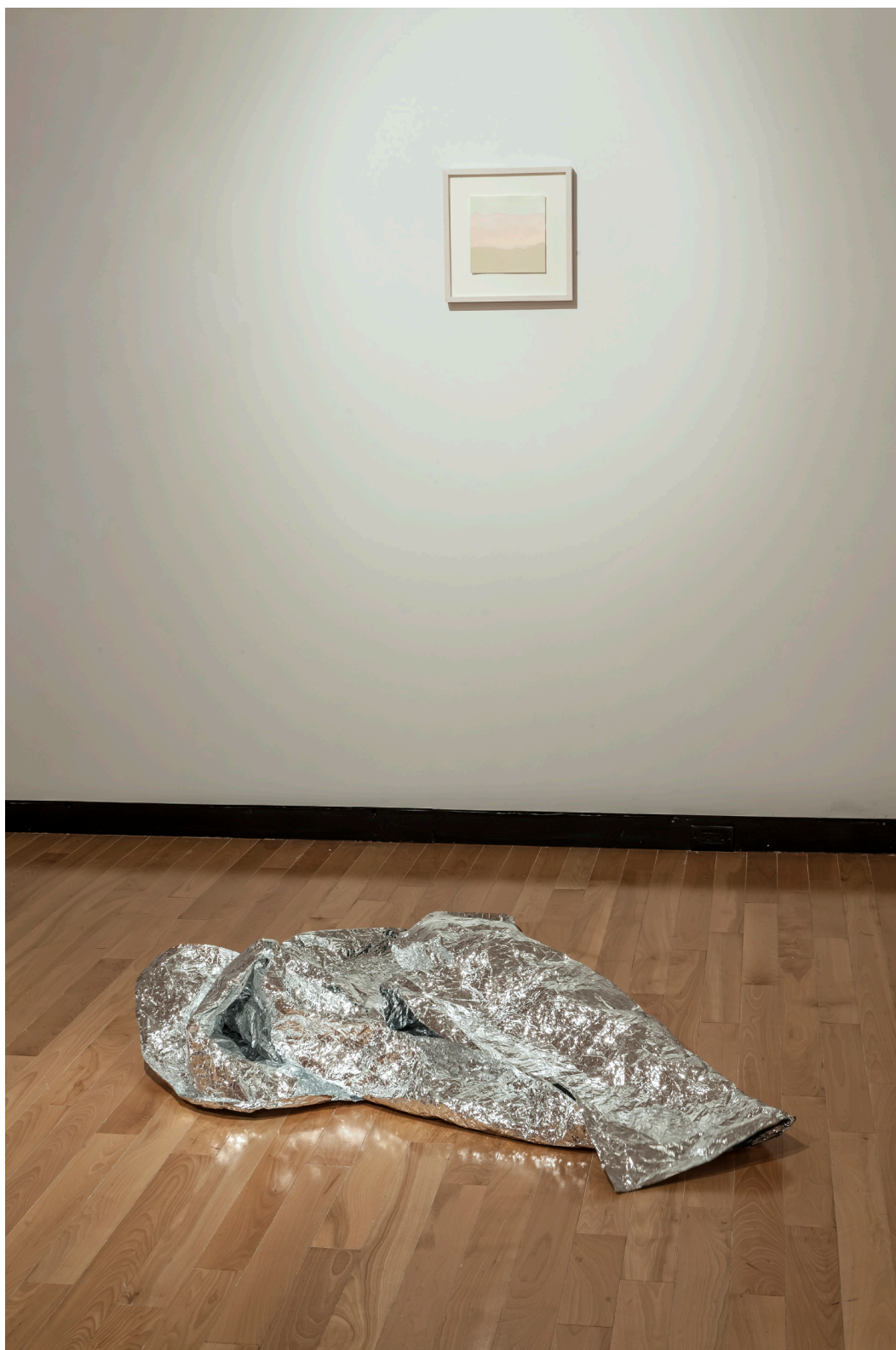
Top: Josh Thorpe, Mountain Study , 2011. Acrylic and latex on paper.