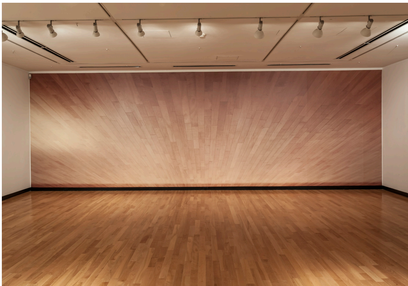
Karen Henderson, Perspective Floor-Wall (with Volume Hear Here lighting), 2013. Photo mural.