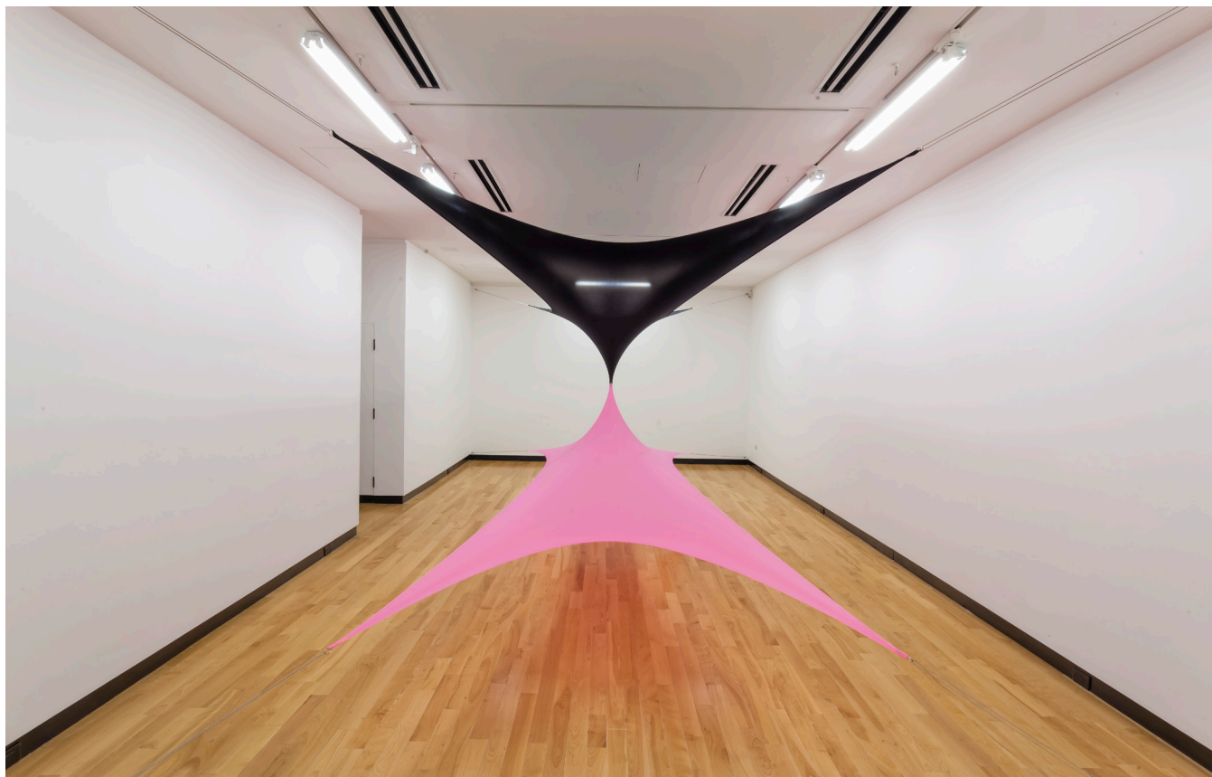
Kika Thorne, Singularity , 2007-ongoing. Lycra, aircraft cable, hardware, rare earth magnets.