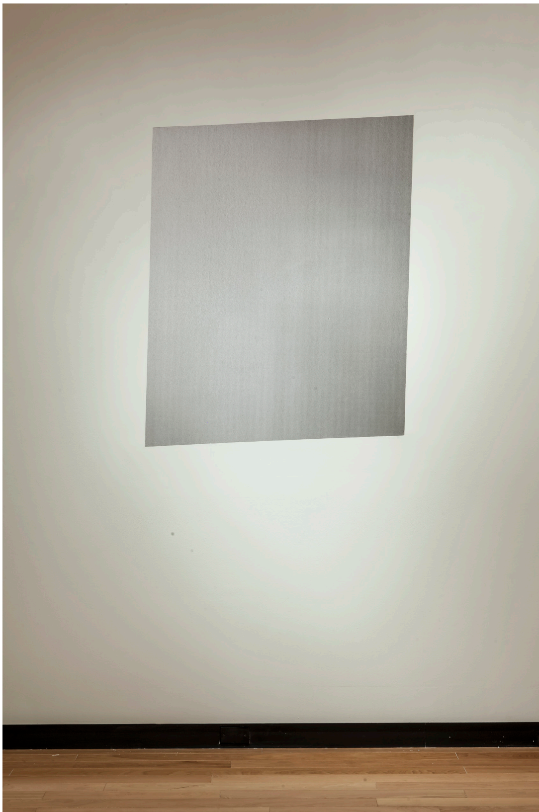
Yam Lau, Lining (...for G.L...), a hidden monument , 2013. Mirrored aluminum, drywall, vinyl.