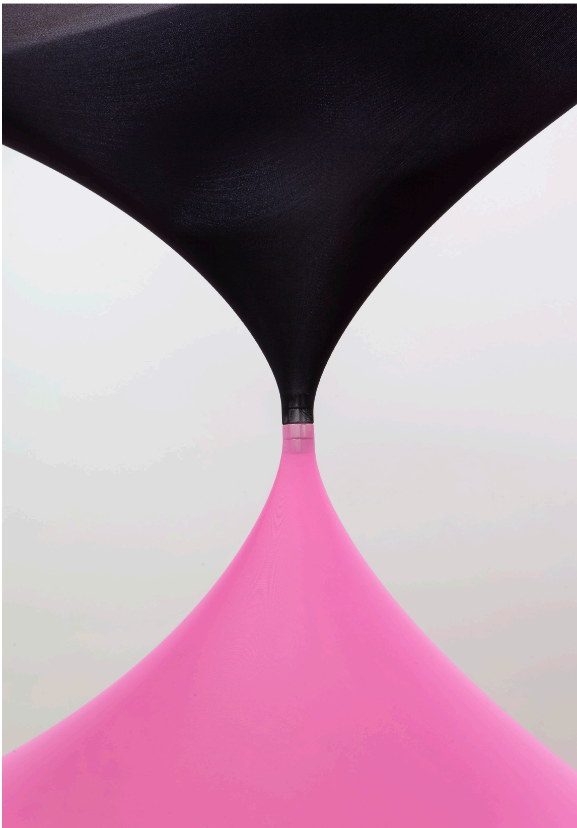
Kika Thorne, Singularity , 2007-ongoing. Lycra, aircraft cable, hardware, rare earth magnets.