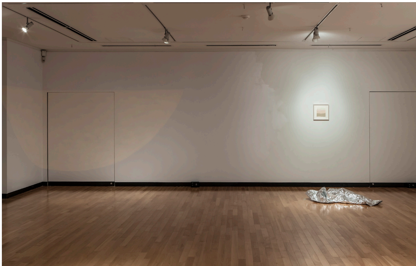
Top, installation view: I Thought There Were Limits , March 28–May 18, 2013, Art Museum at the University of Toronto.