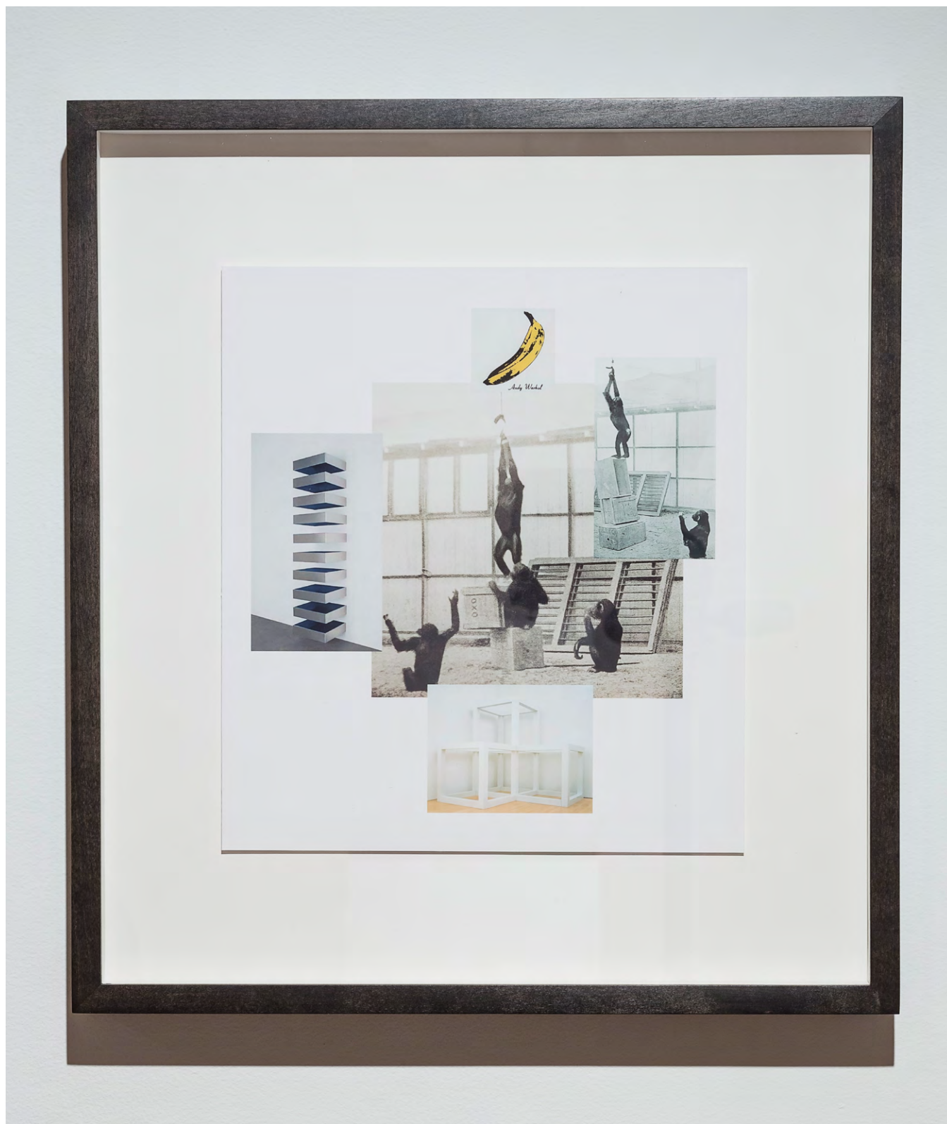
John Marriott, Hidden in Plain Sight , 2013. Digital collage on paper, 11" x 8x5".