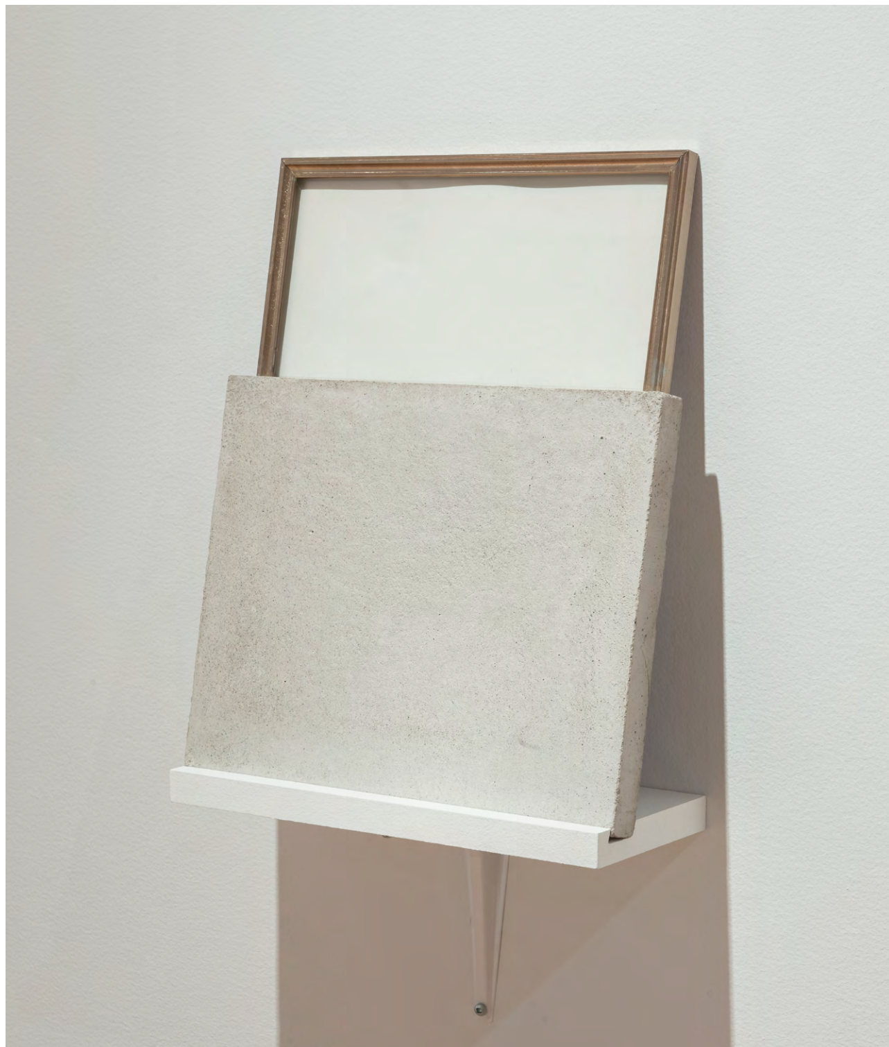
Liza Eurich, Not Quite There (no. 2) , 2010. Concrete, frame, and drawing, 15" x 12".