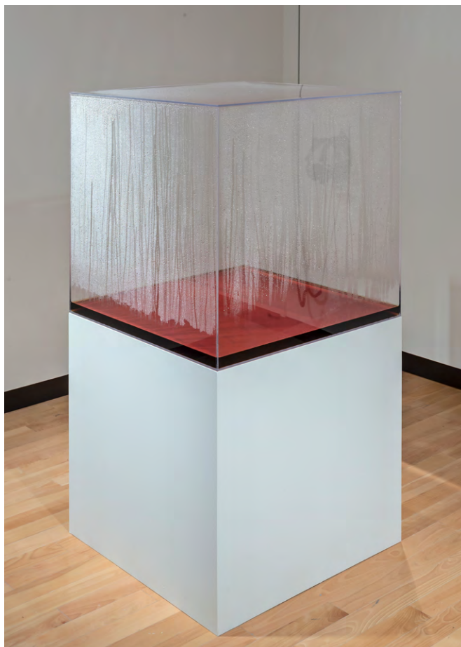
Left: John Boyle-Singfield, Untitled (Coke Zero) , 2012. Plexiglas, Coke Zero, white wooden base, 72 cm x 72 cm).