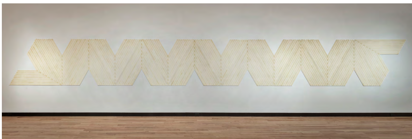
Top, Installation view: Why Can't Minimal , September 2–October 19, 2014, Art Museum at the University of Toronto.