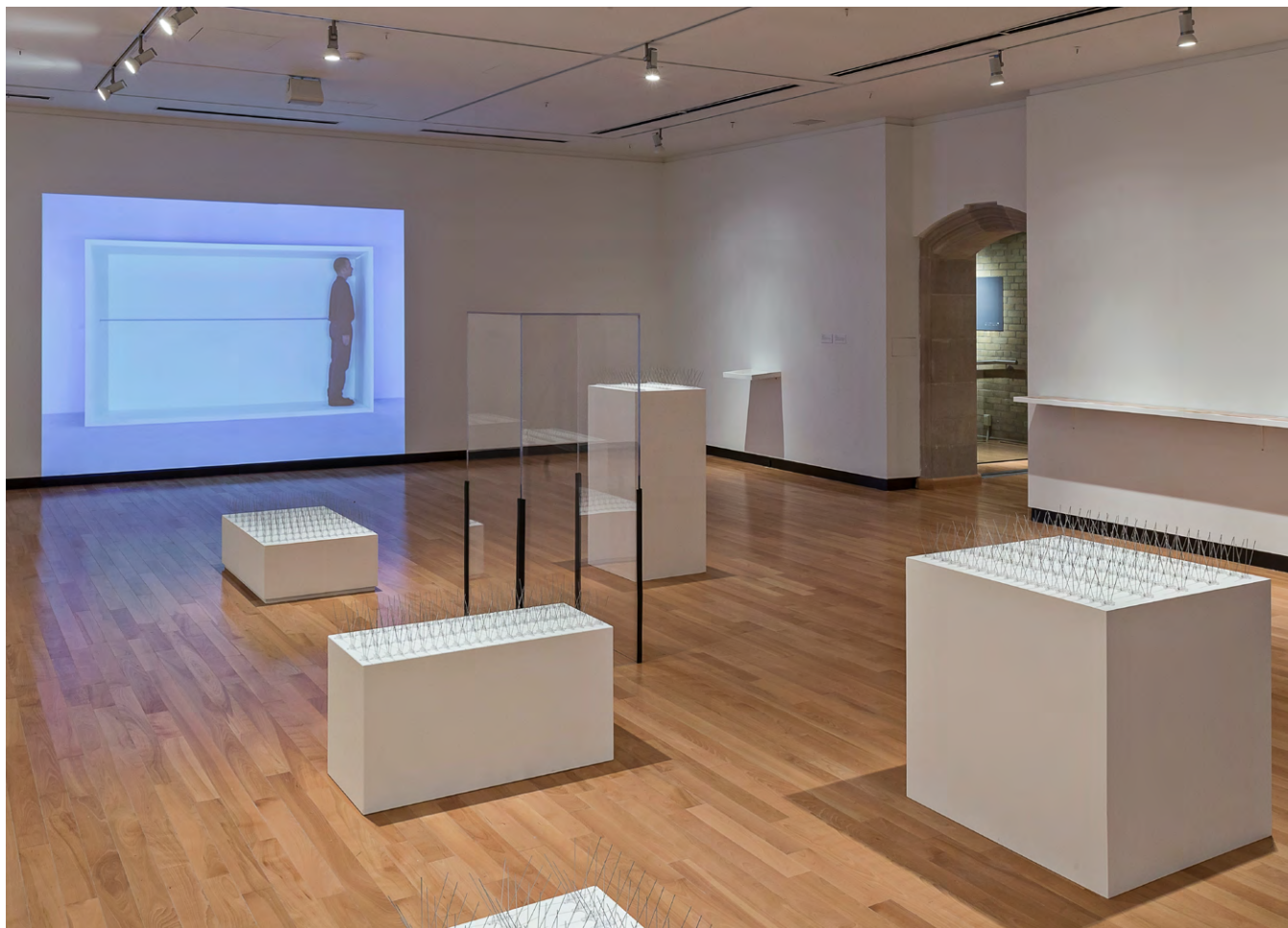
Installation view: Why Can't Minimal , September 2–October 19, 2014, Art Museum at the University of Toronto.