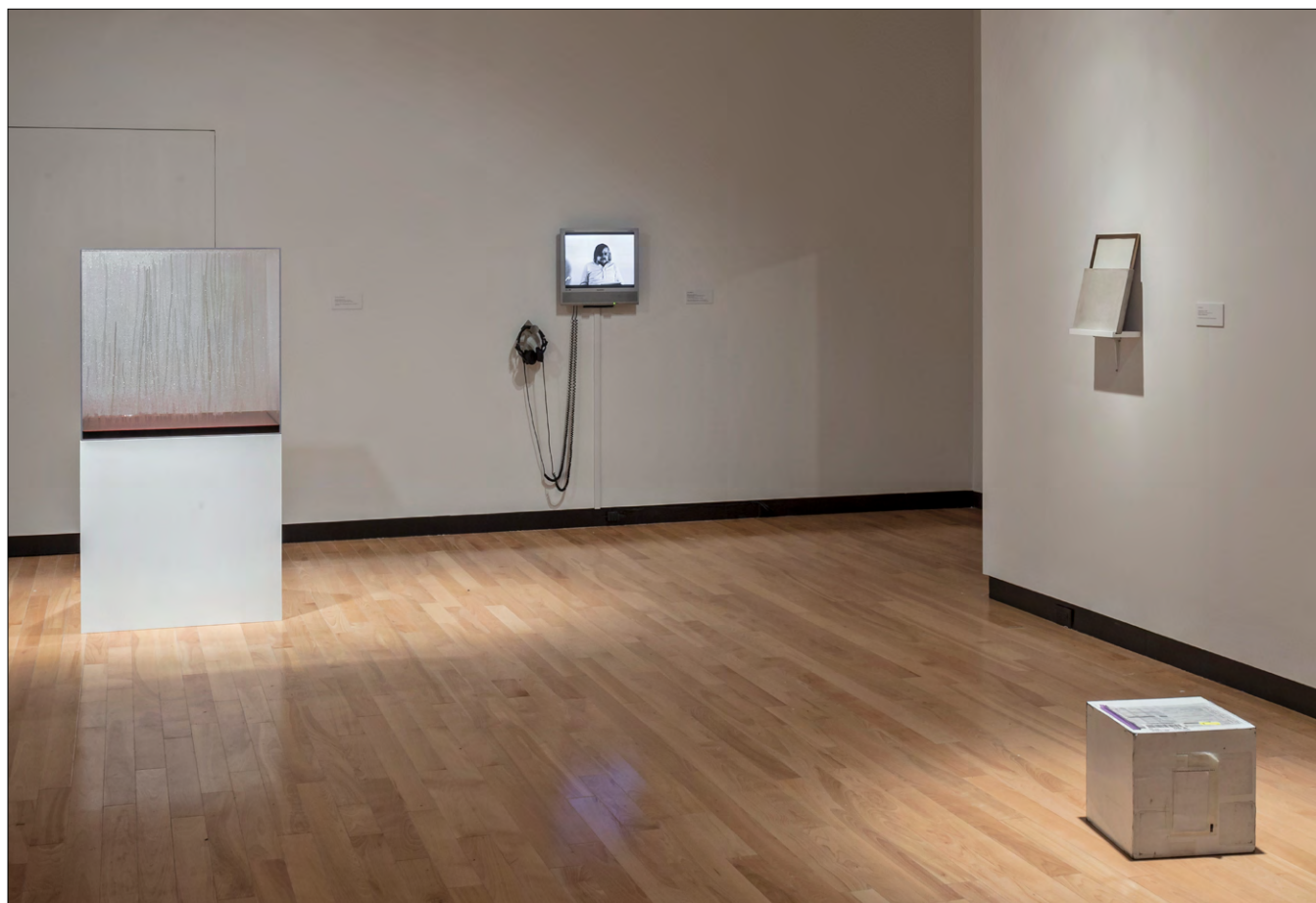
Installation view: Why Can't Minimal , September 2–October 19, 2014, Art Museum at the University of Toronto.