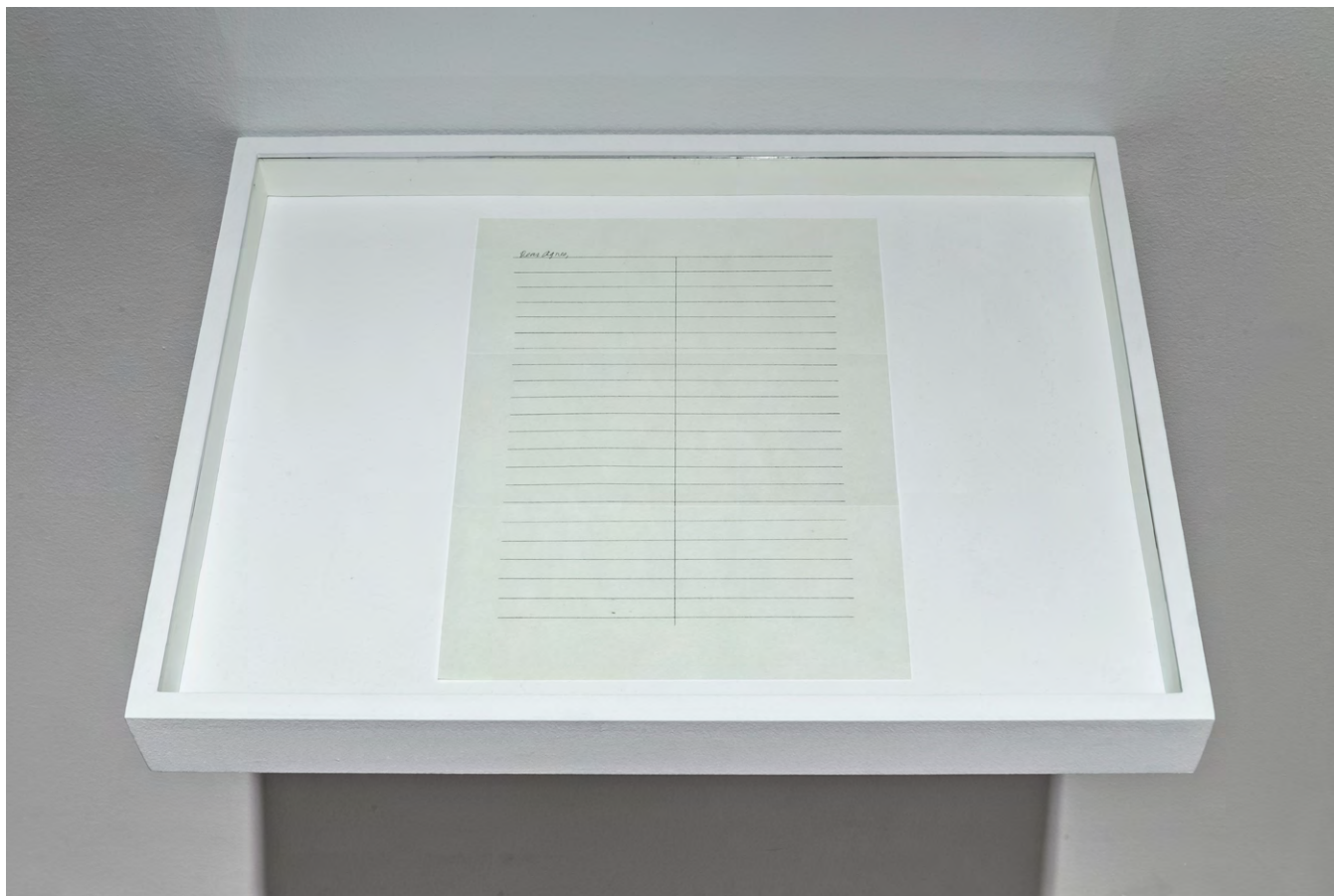
Tammi Campbell, Dear Agnes , 2014. Graphite on Japanese paper, 11" x 8.5".