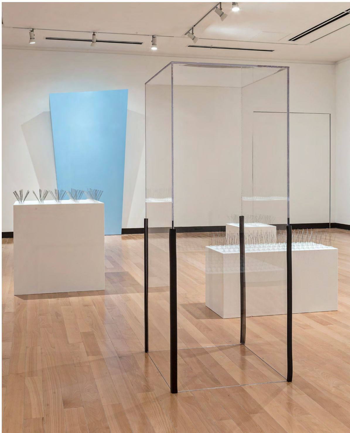
Installation view: Why Can't Minimal , September 2–October 19, 2014, Art Museum at the University of Toronto.