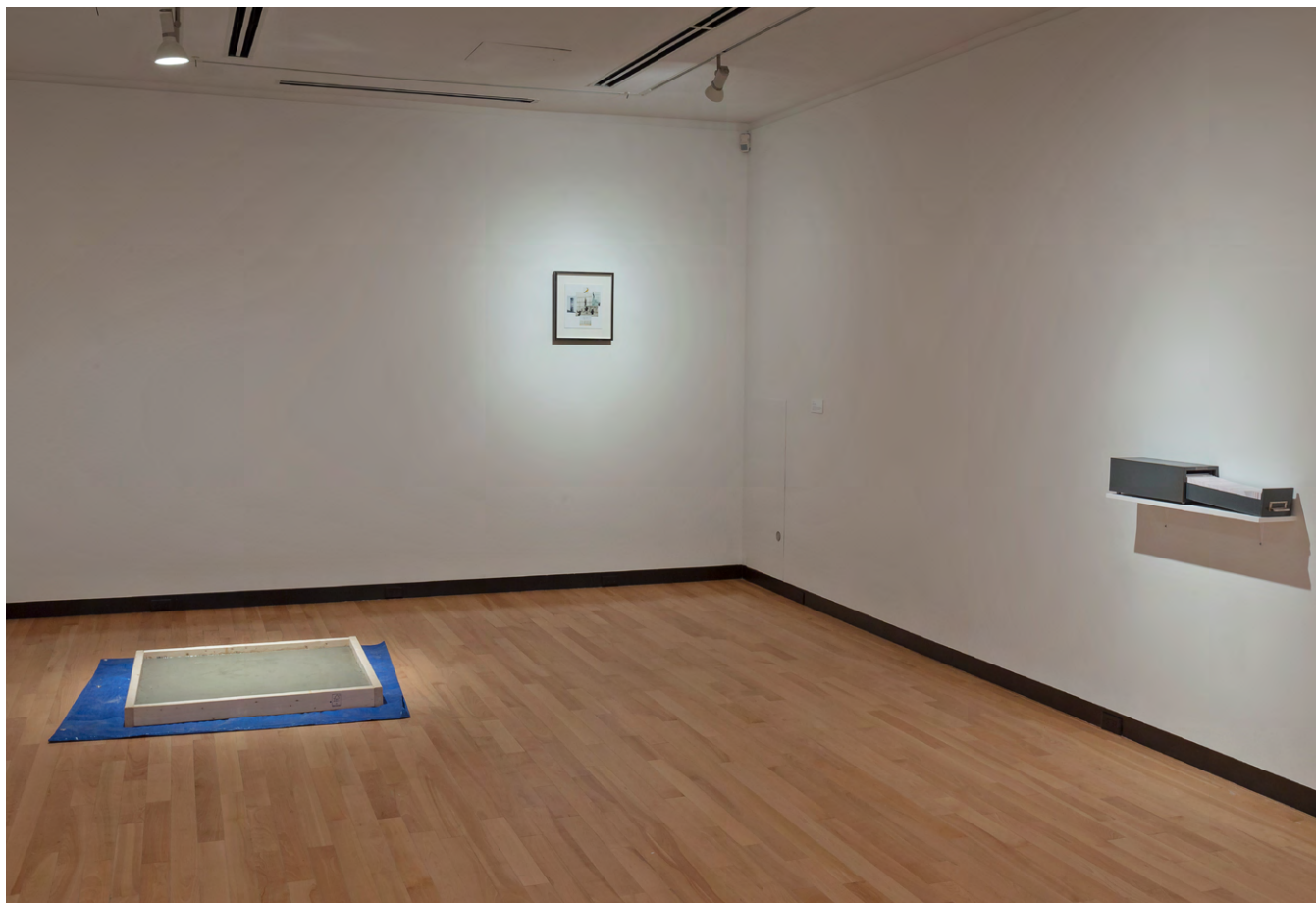
Installation view: Why Can't Minimal , September 2–October 19, 2014, Art Museum at the University of Toronto.