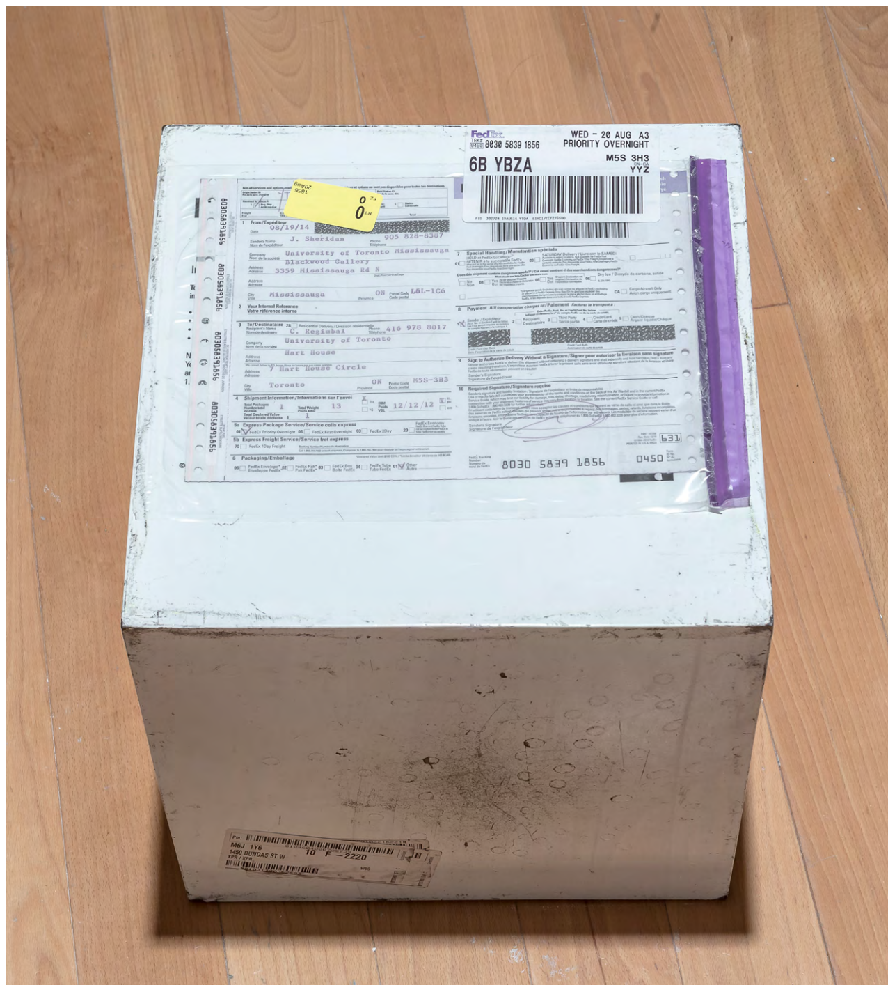
Jon Sasaki, A Minimalist Cube Shipped with Minimal Effort and Expense , 2012. Powder-coated steel cube with shipping labels, 12" x 12" x 12".