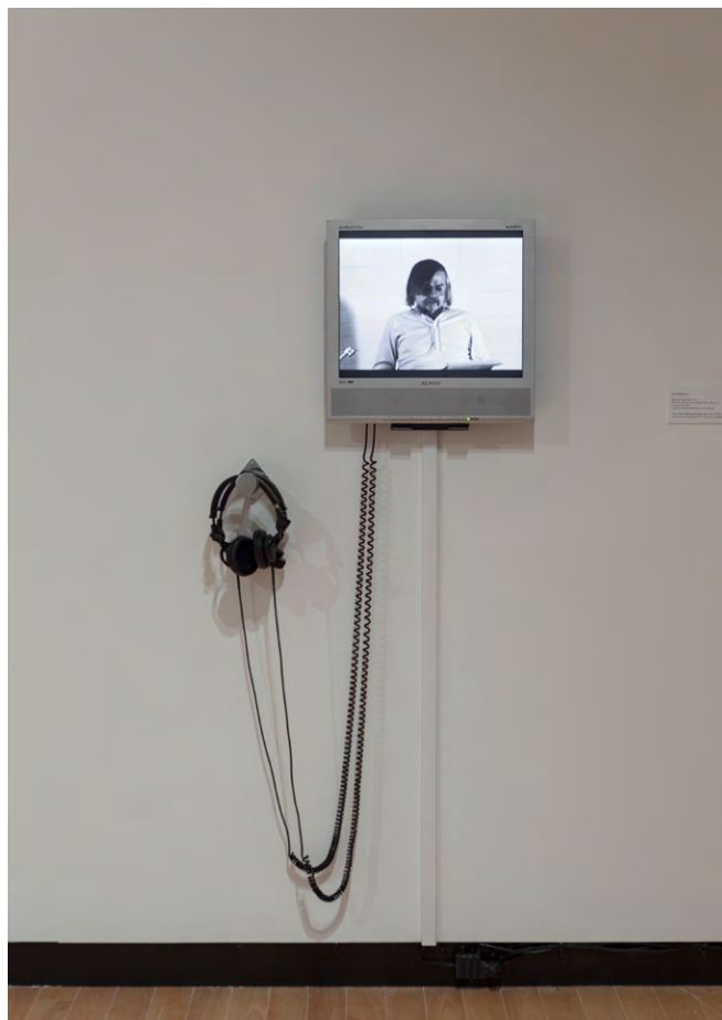
Right: John Baldessari, Baldessari Sings LeWitt , 1972, 00:12:50, United States, English, B&W, Mono, 4:3, 1/2" open-reel video.